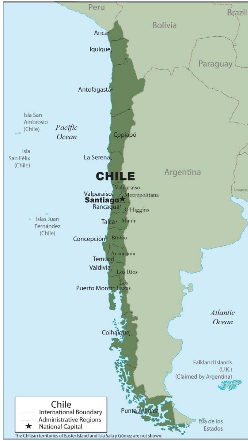
Figure A-1. Map of Chile