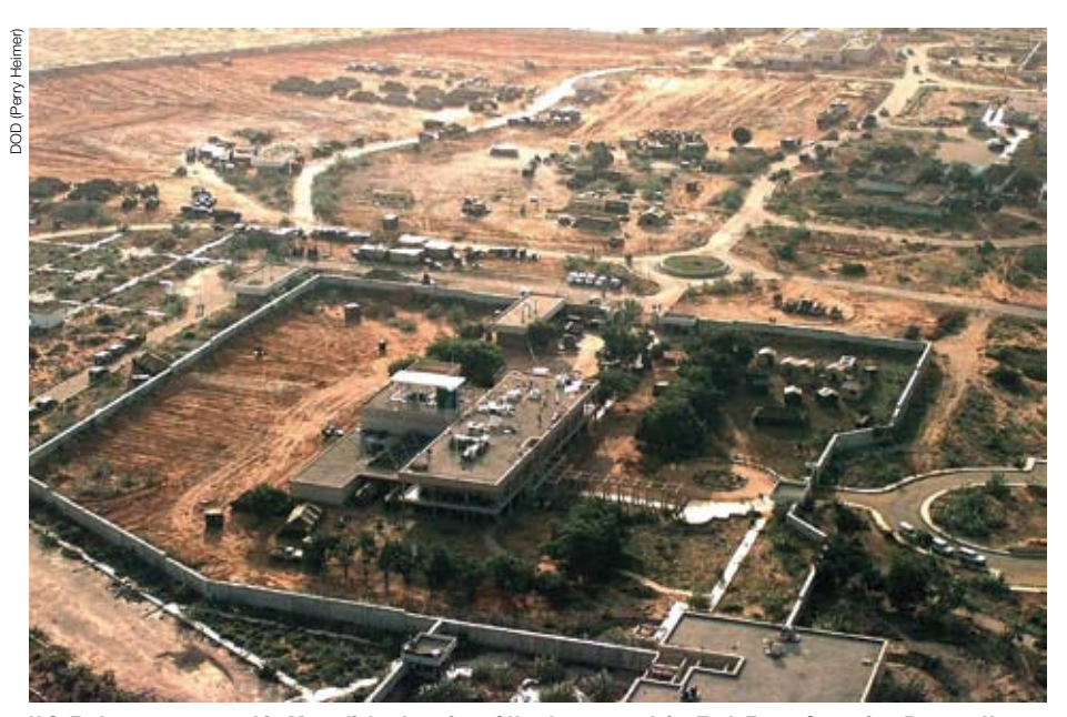
\textbf{U.S.} \ \textbf{Embassy compound in Mogadishu}, \textbf{location of Headquarters, Joint Task Force Operation} \ \textit{Restore Hope}

Driven by a strong desire to pull U.S. forces out, American troop presence in Somalia declined from 17,000 in mid-March to 4,500 in early June as UNITAF disbanded and I MEF went home. Although many coalition units remained, most of the credible combat capability resident in Somalia left with the Americans. This dramatic reduction in U.S. military force coincided with aggressive actions to force various Somali militias to disarm. As Aideed ruled south Mogadishu with his Somali National Alliance (SNA), where UN forces were concentrated, UNOSOM II pressed the Habr Gidr hard. Predictably, there was resistance, and UNOSOM II began to take casualties. Almost immediately, national contingents began to suspend activities that placed them at risk of reprisal. Increasingly, Howe and Mont-