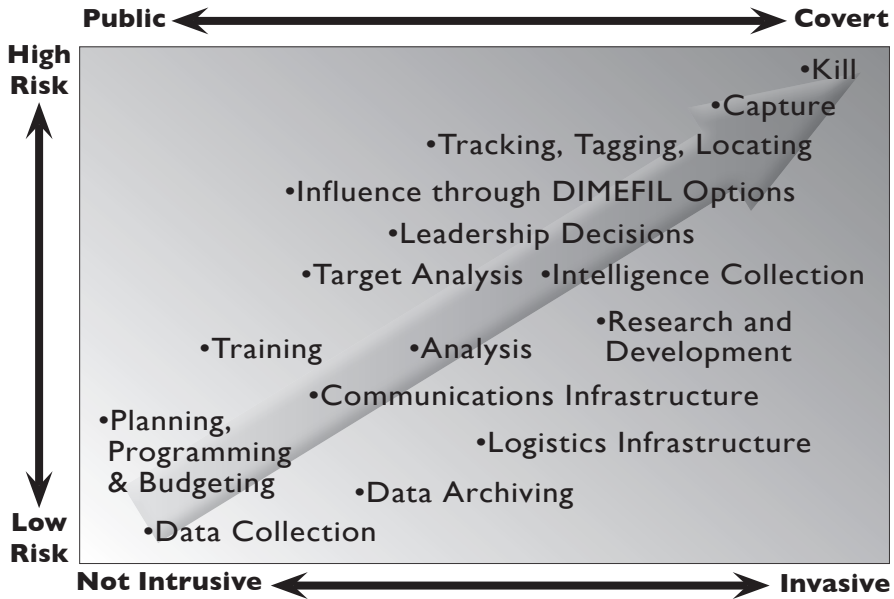
Figure 1. Spectrum of Manhunting-Related Activities

Next on the spectrum one finds infrastructure and logistics—preparatory actions that must take place to enable any subsequent action—conducted in those regions determined most likely to require manhunting activities. Personnel selection, training, and administration of a manhunting force would also fall into this area. Up to this point on the manhunting spectrum, the government has not yet targeted any individuals or human networks.