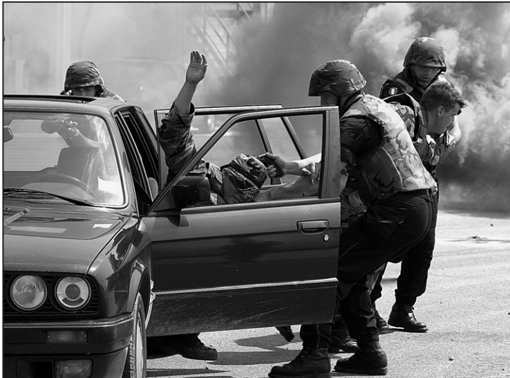
Aviano AB, Italy. Italian Carabinieri (paramilitary police) seize a high value target (HVT) during a joint training exercise with U.S. Air Force security police. The ability to conduct operations in concert with allied internal security forces will be crucial to counter-network and manhunting operations in semipermissive environments.

When conducting counter-network operations on a global scale, it is necessary to carry out activities at tactical, operational, and strategic levels. At the tactical level, it is important to organize forces so that they are best aligned to engage and subdue the enemy. The operational level combines tactical actions into campaigns to defeat networks. The strategic level of a manhunting organization is responsible for orchestrating all of the elements of national power against the enemy, with impact spanning a period of years or decades. Strategic manhunting capabilities must be aligned at three levels: a) departmental or interagency, b) national, and c) international organizations must coordinate and deconflict multiple efforts, bringing each organization's capabilities to bear for best advantage.