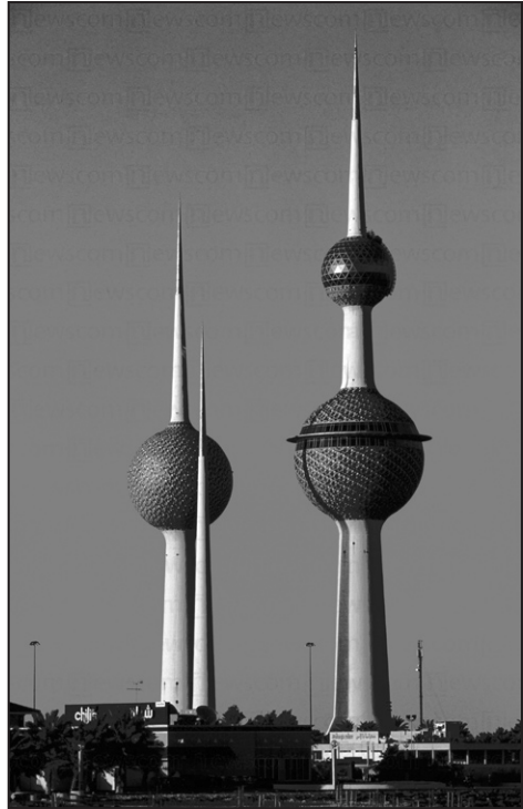
Modern Kuwait. In this November 2007 photo of the Kuwait Towers, a Chili's restaurant can be seen in the lower left. Used by permission of Newscom.

Following the Iraqi invasion, the Amir promised political liberalization and unsuccessfully attempted to placate the opposition with various half measures that failed. Kuwait became an issue in the U.S. election of 1992. Under pressure, the Amir called elections in 1992 and a Majlis dominated by the opposition came into power. The resulting turmoil appeared to foreshadow the dissolution of the Assembly but court rulings against the Majlis averted a confrontation, and the election of 1996 brought pro-government deputies back to power. In 2003, based on their experience in 1990, the Sabah agreed to support Operation Iraqi Freedom. Some have speculated that fear of a perceived internal "Salafist threat" was the driving factor. This is unlikely given that the Salafist opposition in Kuwait with a few exceptions reflects a conservative religious tradition, not a radical jihadist agenda. Quite simply