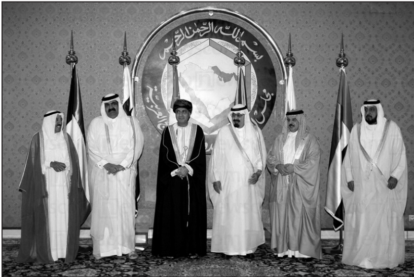
Meeting of Gulf Cooperation Council leaders on 20 May 2008 to celebrate the 75th anniversary of Saudi oil company Aramco.

Local rulers invited the intervention of western powers in order to gain their assistance in furthering dynastic goals. The European powers shifted their support among the local rulers and groupings to attain commercial dominance. In the early 17th century, the British East India Company allied with the Safavids, and other local tribes drove the Portuguese from the Gulf and Oman. In 1602, the Shi'a Safavids with assistance from the British East India Company occupied and held Bahrain until 1782. For political and tribal groups in the Gulf, their views of British intervention were a matter of perspective. Groups that came to power as partners and allies of the British tended not to reflect the attitude of grievance about imperial intervention. Most of those political groupings still dominate the Gulf today. The Seven Years' War (1756–1763) was the key event that permanently altered the geopolitical importance of the Gulf, imperial British security requirements, and eventually created the modern GSS. 8