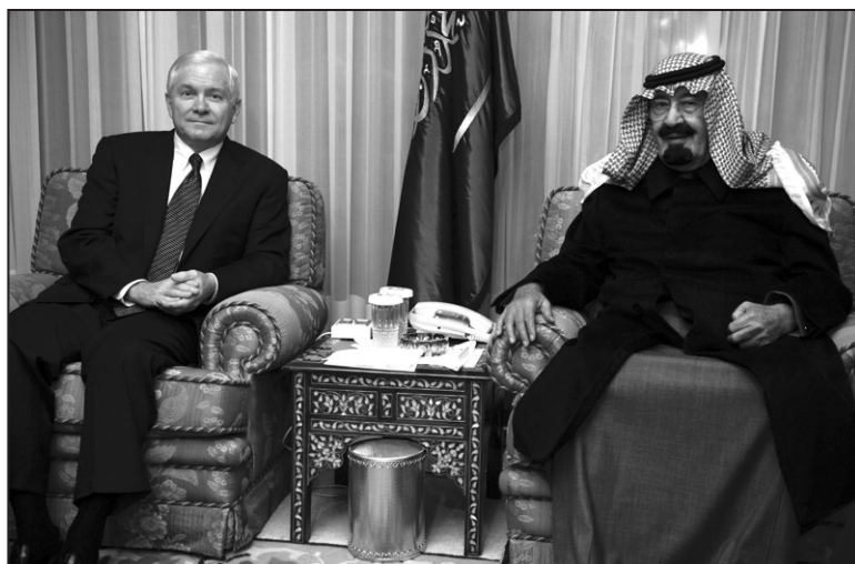
King Abdullah bin Abdul al-Saud meets with Secretary of Defense Robert M. Gates at the king's hunting lodge in Saudi Arabia, 17 January 2007.

Added to these issues, U.S. policy in the Arabian Gulf thwarted the Saudi vision of the GCC. The U.S. bilateral relationships around the Gulf encouraged the policy independence of the emirates. Since Saudi Arabia would clearly be the dominant partner in GCC collective security, Riyadh viewed this as a critical policy goal both from the standpoint of Gulf security and because it fit the Kingdom's image of its role in the region. If indeed that was the desired policy goal of the United States, then rather than expanding its bilateral ties in the region, Washington needed to be pulling back and pressing the emirates to fully embrace the GCC as the collective security arrangement. The current situation in which the U.S. embraced the idea of collective security through the GCC but continued to expand its bilateral relations with the emirates encouraging bilateral security arrangements fundamentally conflicted. One of two things was occurring. Either the U.S. was being duplicitous in its approach to Gulf security and the Saudi role in