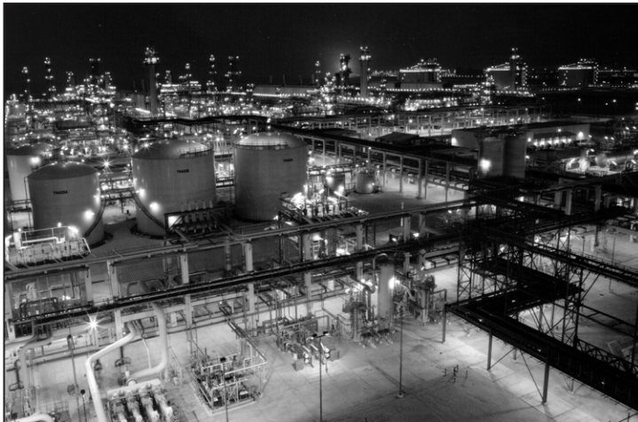
Qatar Liquefied Natural Gas (LNG) Plant.