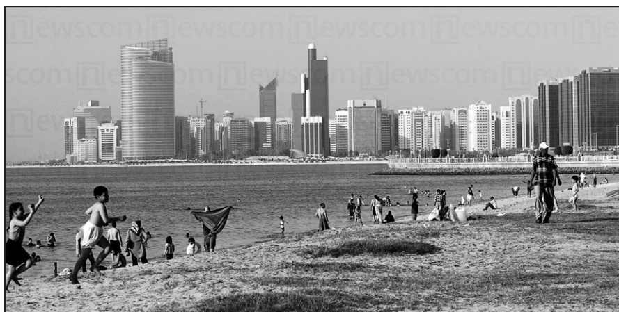
A day at the beach in Abu Dhabi, 29 January 2007.

As discussed earlier, friction between Bahrain and Qatar effectively thwarted unification of the nine southern emirates. Abu Dhabi and Dubai now faced the challenge of unifying the Trucial Coast. The challenges were