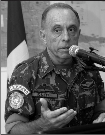
2 February 2006 , Brazilian Army General Jose Elito Carvalho de Siqueira, then commander of the United Nations Stabilization Mission in Haiti (MINUSTAH), during a press conference in Port-au-Prince.

developed by the Eastern Military Command in Rio de Janeiro in 1994, is an example of those successful deployments. Public poll results clearly demonstrate that more than 75 percent of populations in the largest Brazilian cities want the deployment of the Armed Forces to resolve public security problems. 66