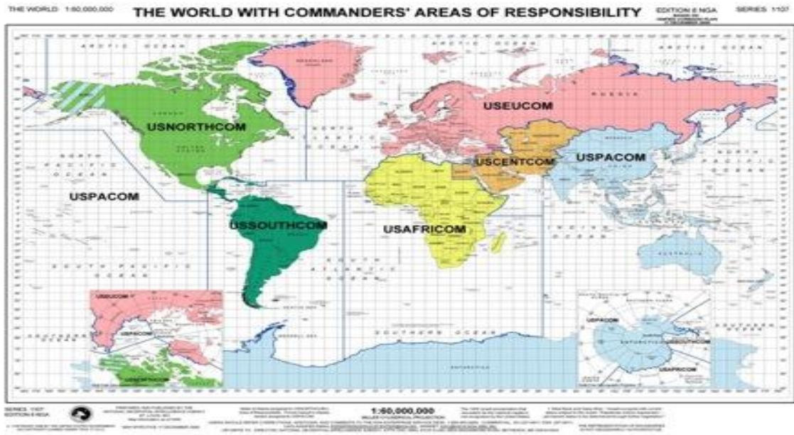
Figure 2: Geographic Combatant Command Regional Boundaries (UCP 2008)

means of command and control. It is helpful to eliminate sources of friction that contribute to inertia against change. One source is the argument that unified action will not be possible while the DoD's Unified Command Plan (UCP) Area's of Responsibility (AOR's) are different than the State Department' regional bureaus (figure 2 and figure 3 represent the DoD Geographic Combatant Command AORs and DoS regional