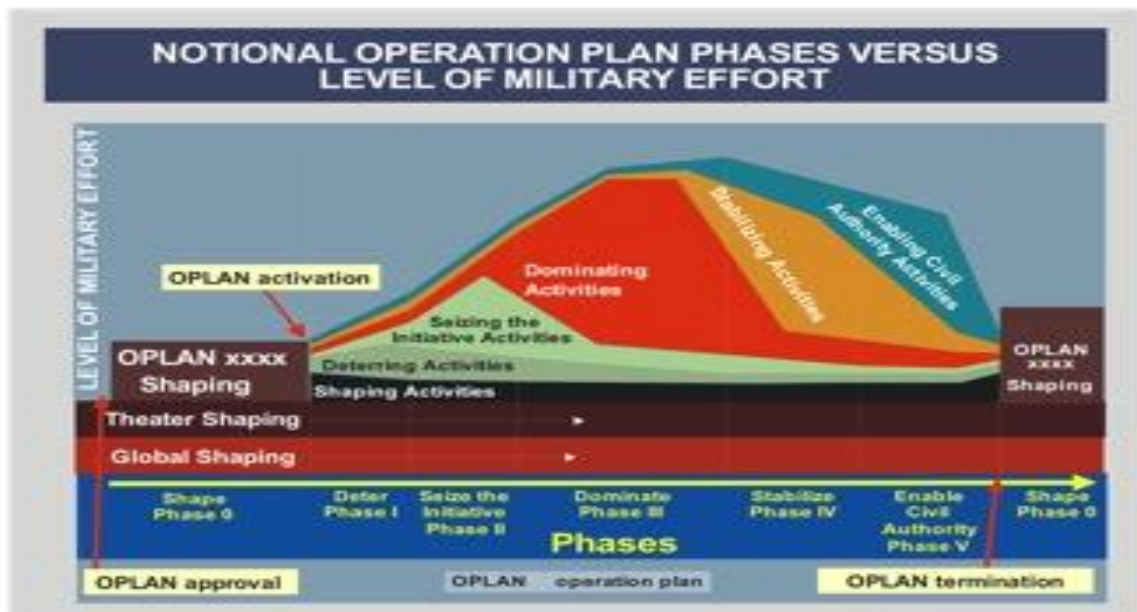
Figure 1: Joint Phases and Notional Military Effort (JP 3-0)

The intent of the Theater Campaign Plan is to avoid stove piped contingency planning by requiring Combatant Commander’s (CCDRs) to generate an AOR wide holistic plan incorporating all contingency plans as branches, in case the TCP fails. 25 Embedding theater contingency plans within the TCP also requires the CCDR to synchronize all military and interagency phase zero (shaping) 26 activities within the AOR to deter potential adversaries and achieve common strategic end states. Figure 1 depicts the joint phasing construct with notional level of military effort by phase of operation. 27 In essence, the Theater Campaign Plan “operationalizes” the CCDR’s theater strategy. 28 DoD instruction requires the CCDR “integrate stability operations tasks and considerations into their Theater Campaign Plans,