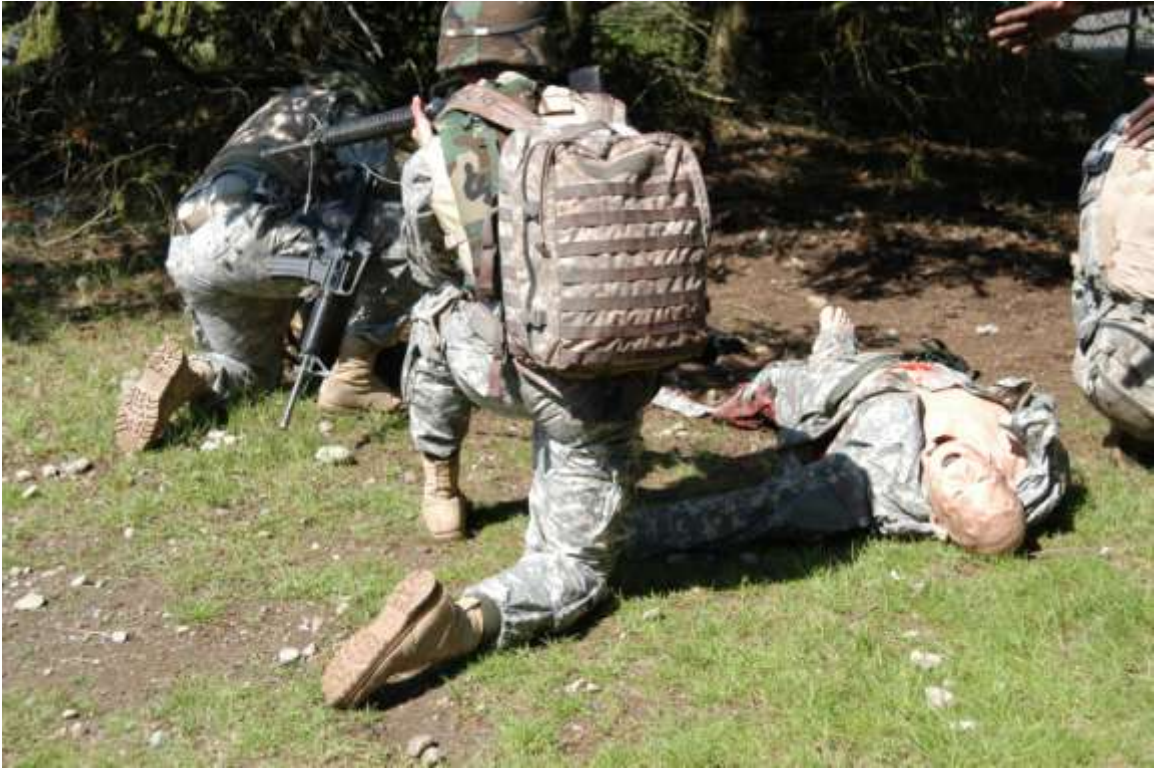
Figure 1. The Stand Alone Patient Simulator