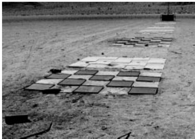
Figure 4. 105-mm HE Cartridge Case on Matrix.

On the 180° radial, intact rounds were found at 5, 15, 47, and 226 ft. A propellant bag from the 105 rounds was found at 75 ft 8 in. Cartridge cases were found at 9 ft 10 in and 300 ft 10 in. Another cartridge case was found at 130° and 78 ft 5 in. Part of a cartridge case on a burned propellant matrix (no. 2) is shown in Figure 4. A video of the ignitions will be shown.