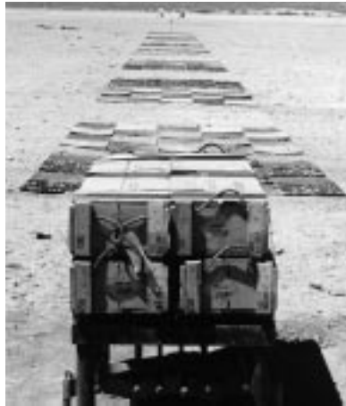
Figure 7. 105-mm WP-T Test Arrangement.

M416 105-mm WP-T Test. Four boxes, with two rounds each of WP rounds with fixed propelling charges, were placed on the burn stand with the long axis of the boxes aligned with the 90 and 270° radials. The boxes were stacked with two on the bottom and two on the top, as shown in Figure 7.