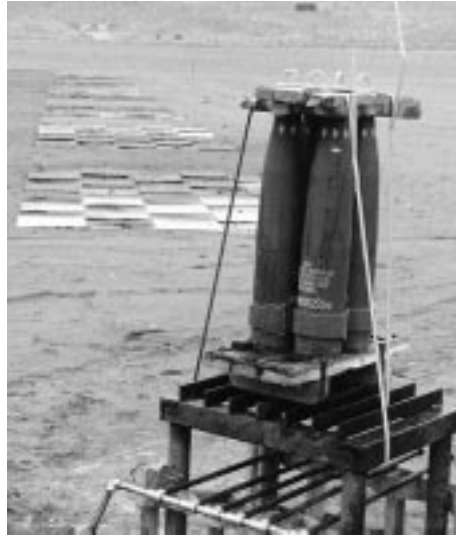
Figure 6. 155-mm ICM Pallet.

When fire was started at 1121, the wind speed was 1 to 2 kn from 90° and light rain was falling. At 1130, a pop was heard, which observers said was a nose plug blowing out. Fifteen seconds after the pop, a violent reaction occurred, blowing all of the rounds off of the test stand. One round was observed bouncing out to about 800 ft between the 30 and 40° radials. At 1135, the round at 800 ft exploded, sending fragments and debris flying in all directions. The fuel to the fire was turned off at 1151, and no further reactions were observed or heard.