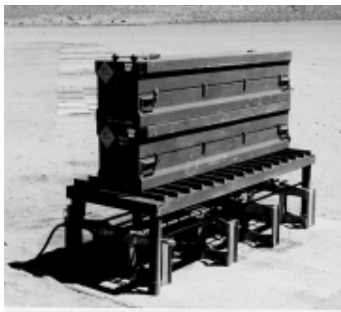
Figure 3. Hellfire Test Arrangement.

Hellfire, AGM 114A, PA-79 Test. Two Hellfire missiles, AGM 114A, in containers were positioned on the burn stand, with one container atop the other. The noses of the missiles were oriented directly down the 90° radial. The missile containers were strapped to the burn stand with 1-in metal bands to restrain the missiles for safety reasons. A larger burn stand and burner were constructed, as shown in Figure 3. The bottom of the bottom container was 11 in above the burner.