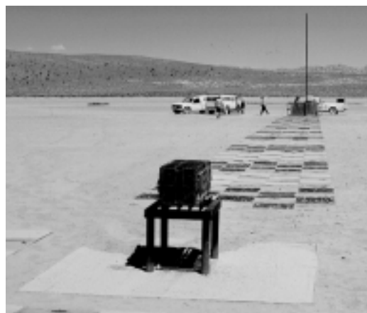
Figure 2. 25-mm Test.

25-mm APDS-T M791 Test. Five boxes of M791 25-mm rounds (30 linked rounds per box) were horizontally stacked on the burn stand with the ends of the boxes in line with the 0 and 180° radials. That is, the noses and tails of the rounds were oriented along the 270° radial. All of the 25-mm rounds have tracers. The boxes are fiber-reinforced plastic. The setup is shown in Figure 2.