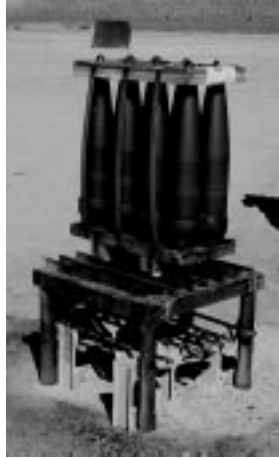
Figure 5. 155-mm RAP Pallet.

motor ignited, pushing a round clockwise around the burn stand, going airborne, and flying out to about 350 ft at 50°. At 1100 a violent explosion occurred, sending fragments flying in all directions and putting out the fire. The burner was damaged such that the fire could not be relit.