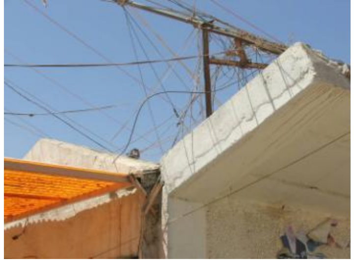
Site Photo 11. Electrical wiring connecting to system

The individual market shops had either solid steel doors or folding metal grills for security (Site Photo 12). The quality of the doors appeared to be typical of locally available materials. Several doors inspected had padlocks as required in the SOW.