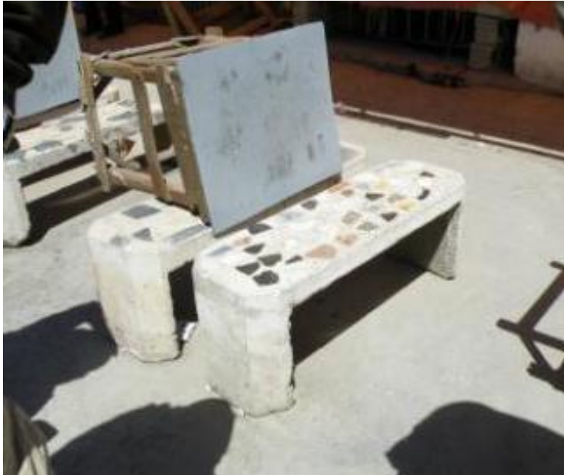
Site Photo 13. Pre-cast concrete benches

The SOW required the contractor to provide six pre-cast concrete benches for the project; however, the project file documentation lacked design information. SIGIR verified the presence of six pre-cast concrete benches on the project (Site Photo 13), which appeared to be of poor quality.