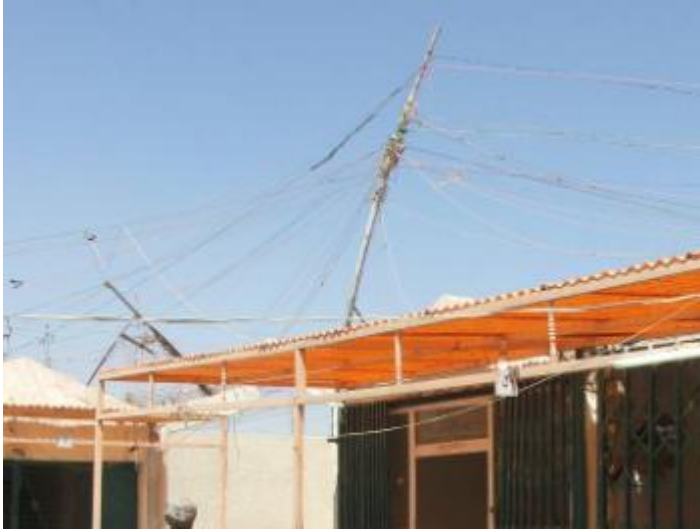
Site Photo 10. Electrical wiring without conduit