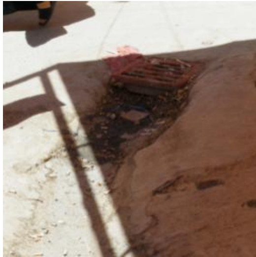
Site Photo 17. Gutter inlet

During the site visit, SIGIR identified drainage gutters in the concrete slab around the perimeter of the market courtyard. The drainage gutters consisted of a V-channel slope and allowed drainage to flow to the cast iron inlet grate (Site Photo 17). Because of time constraints, SIGIR was unable to determine whether the inlets were connected to a larger drainage system.