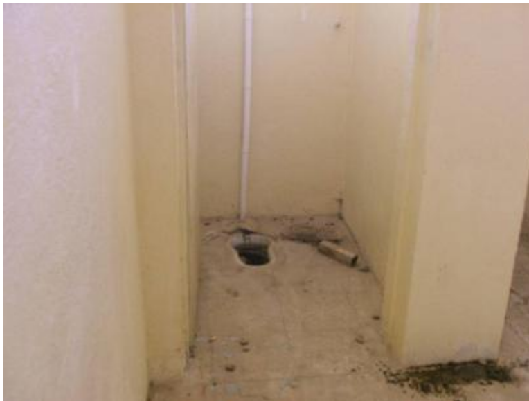
Site Photo 16. Restroom stall

At the time of SIGIR's site visit, there was no water service to the restrooms. According to the market manager, the contractor connected the restrooms to the existing municipal water supply line. However, the contractor later disconnected the municipal water supply line to the restrooms. The market manager claimed that the contractor was trying to extort money from the shop owners to restore water service to the restrooms. SIGIR performed the inspections that it could in the time available and could not validate the assertion that the contractor had disconnected the municipal water supply line to the restrooms. The municipal water line was underground and there was no apparent disturbance of the ground around the Ammana Market.