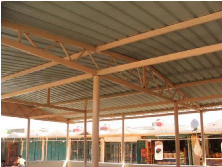
Site Photo 4. Steel roof trusses and columns—typical underside

SIGIR observed four steel awnings installed over the interior courtyard of the market (Site Photo 4). The roof structure consists of steel pipe columns supporting steel trusses. The columns were cast into the concrete slab; therefore, the size and configuration of the foundation system could not be verified.