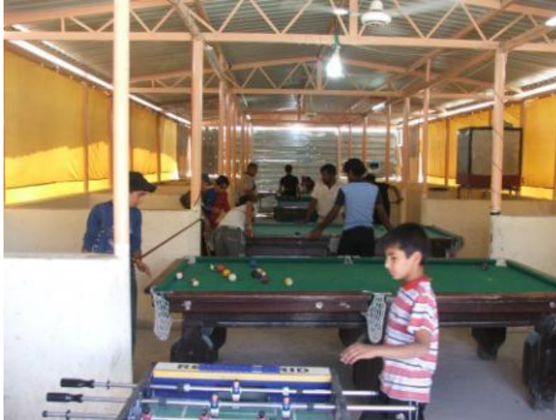
Site Photo 6. Modified interior stalls made into a game room

Under the awnings, one section of interior stalls was enclosed with tarpaulins, corrugated metal, and assorted construction materials and made into a makeshift game room. Evaporative coolers were installed at several points around the perimeter of the game room. The local citizens provided billiards, foosball, and other games for local children to play while their parents shopped at the market (Site Photo 6).