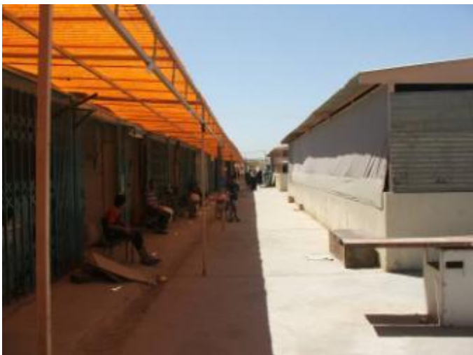
Site Photo 2. Slab along existing shops

The concrete pad was constructed with expansion joints along the edges of the existing shops (Site Photo 2) and in the parking area (Site Photo 3); however, it was not apparent whether expansion joints were constructed in the slab beneath the steel truss roofs of the market stalls. Also, the contractor did not maintain the site: a bicycle had been ridden through the wet concrete.