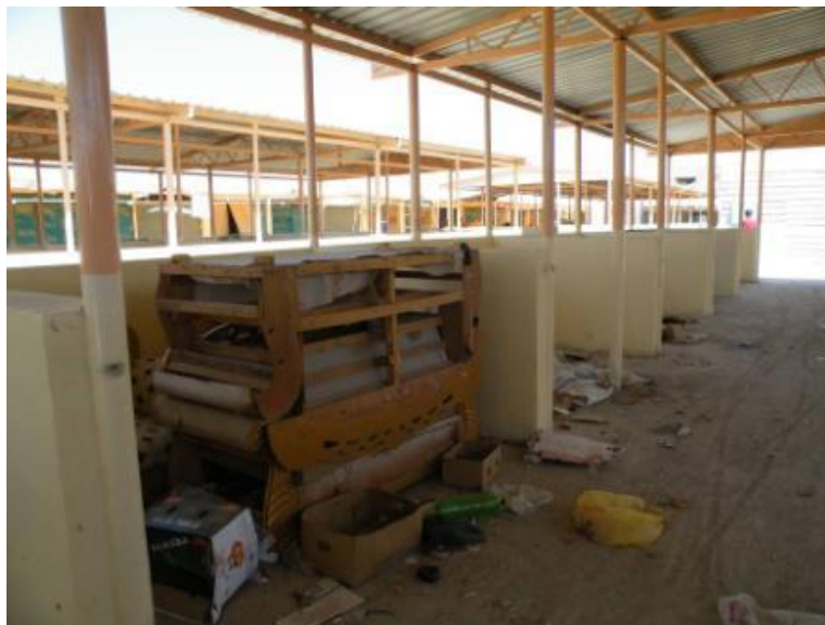
Site Photo 5. Masonry stalls with center aisle

SIGIR observed a masonry infill approximately 1m high around the perimeter of the columns, with openings at either end. Also, masonry was constructed between the interior columns that divided the area into individual stalls with the main aisle in the center (Site Photo 5).