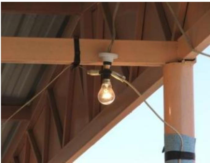
Site Photo 8. Light affixed with bailing wire

The construction of the internal electrical system was poor and did not conform to any known code. Light fixtures were affixed to the structure with bailing wire (Site Photo 8) or improvised wooden mounts and connected to the electrical system with temporary connectors (Site Photo 9). SIGIR observed that the electrical wiring was strung along the roof without conduit (Site Photo 10), and the electrical wiring appeared to be connected to a poorly constructed existing system (Site Photo 11).