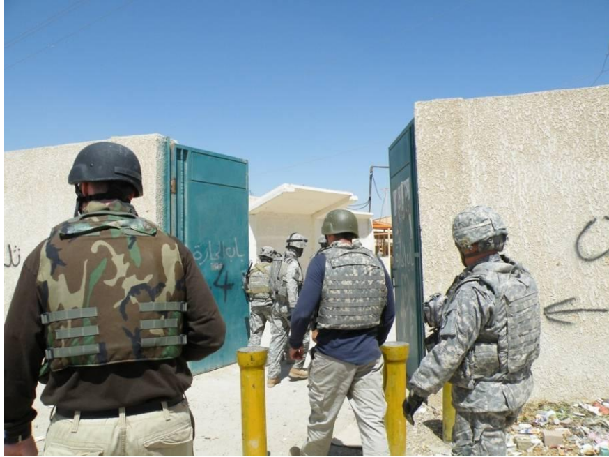
Site Photo 14. Bollards and pedestrian gate

The SOW required the contractor to construct six animal corrals. Because of time limitations, SIGIR was unable to physically inspect the corrals; however, SIGIR did verify the existence of some of the corrals (Site Photo 15).