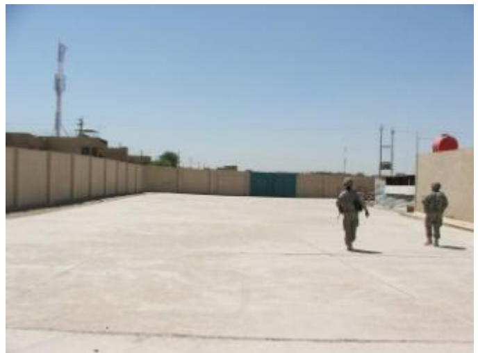
Site Photo 3. Slab at parking area