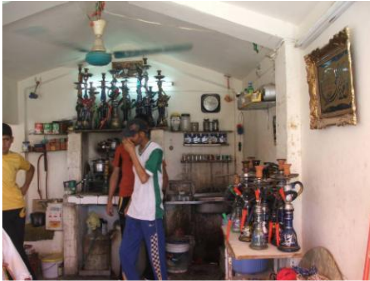
Site Photo 7. Typical shop interior

At the time of the site visit, the Ammana Market was supplied with power. SIGIR observed that the shops had several lights and ceiling fans installed, and the courtyard had exterior lighting. SIGIR was unable to determine which light fixtures were installed by the contractor and which light fixtures were modified by the shop occupants.