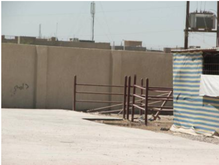
Site Photo 15. Animal corrals

The SOW required the contractor to construct six animal corrals. Because of time limitations, SIGIR was unable to physically inspect the corrals; however, SIGIR did verify the existence of some of the corrals (Site Photo 15).