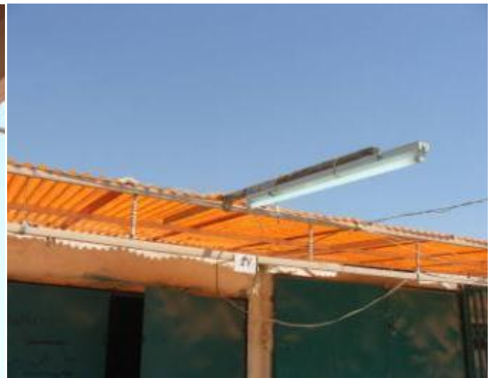
Site Photo 9. Light fixture with wooden mount