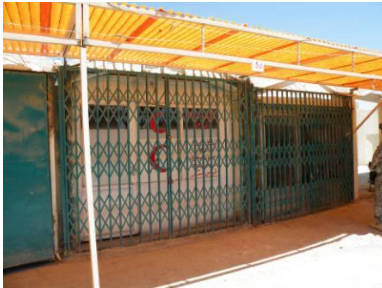
Site Photo 12. Security doors and grills

The individual market shops had either solid steel doors or folding metal grills for security (Site Photo 12). The quality of the doors appeared to be typical of locally available materials. Several doors inspected had padlocks as required in the SOW.