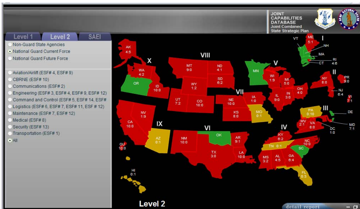
Figure 2. JCD, Level Two NG Current Force

represents the quantity of essential ten capabilities the state assesses as mitigated. Compiling the total number of inadequate assessments for the red color-coded states yields two hundred thirty (230) deficiencies. Another fifty four (54) deficiencies are assessed as mitigated. Therefore, this snapshot in time depicts a total of two hundred eighty four deficiencies with nineteen (19 percent) mitigated.