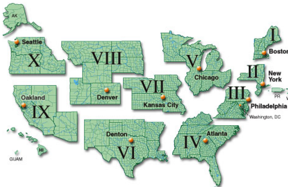
Figure 1. Map of Federal Emergency Management Agency

Source: Federal Emergency Management Agency “Organization Structure Regional Operations,” 26 February 2008, http://www.fema.gov/about/structure.shtm (accessed 16 July 2009). NOTE: The ten FEMA regions include: Region I (Connecticut, Maine, Massachusetts, New Hampshire, Rhode Island, Vermont); Region II (New Jersey, New York, Puerto Rico, and the Virgin Islands); Region III (Delaware, District of Columbia, Maryland, Pennsylvania, Virginia, and W. Virginia); Region IV (Alabama, Florida, Georgia, Kentucky, Mississippi, N. Carolina, S. Carolina, and Tennessee); Region V (Illinois, Indiana, Michigan, Minnesota, Ohio, and Wisconsin); Region VI (Arkansas, Louisiana, New Mexico, Oklahoma and Texas); Region VII (Iowa, Kansas, Missouri, and Nebraska); Region VIII (Colorado, Montana, N. Dakota, S. Dakota, Utah and Wyoming); Region IX (Arizona, California, Hawaii, Nevada, American Samoa, Guam, Commonwealth of the Northern Mariana Islands, Republic of the Marshall Islands, and Federated States of Micronesia); Region X (Alaska, Idaho, Oregon and Washington).