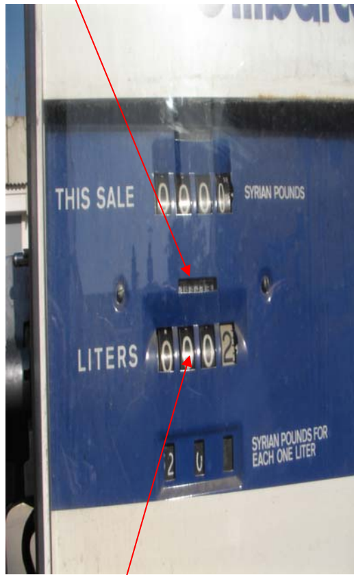
Normal Dispensing Meter