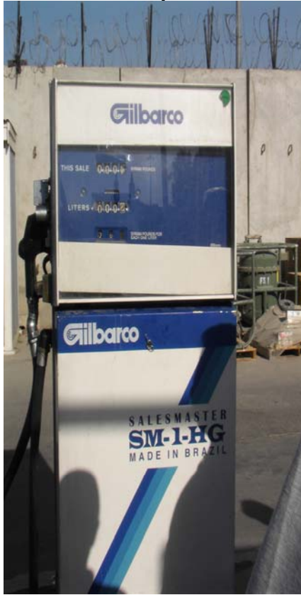
Retail Fuel Pump