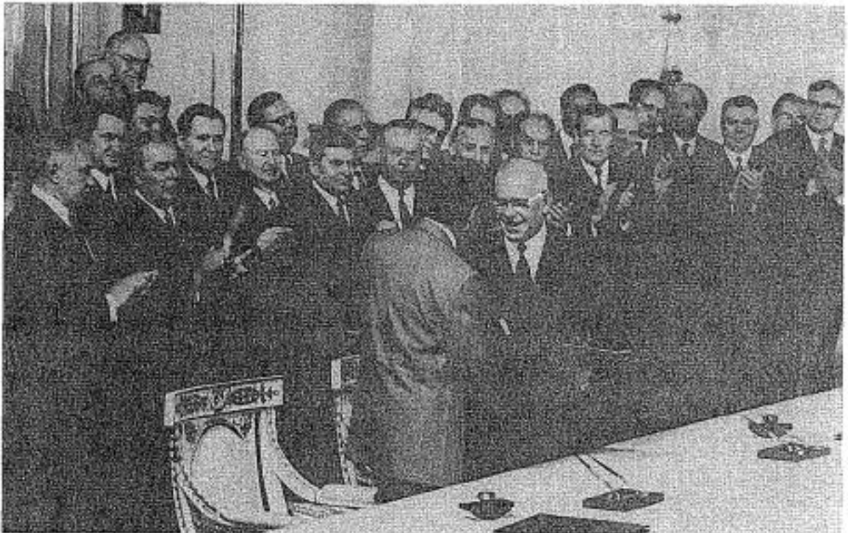
President Nixon shown in the Kremlin shaking hands with President Podgorny after the SALT I signing ceremony during his summit visit to Moscow in May 1972.

ideological competition. Moscow has charged that Mao has abandoned Communist principles and is aiming at world domination. China was upset when she perceived Brezhnev's proposal to sponsor an Asian collective security pact as a deliberate attempt at encircling and isolating her. However, since the border crisis of 1969, there has been a general easing of Sino-Soviet tensions, except for verbal battles in the UN General Assembly. This trend will permit the Chinese to expend more energy in seeking to extend her influence into Southeast and Northeast Asia.