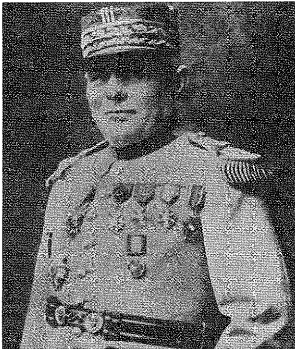
General J.E. Estienne