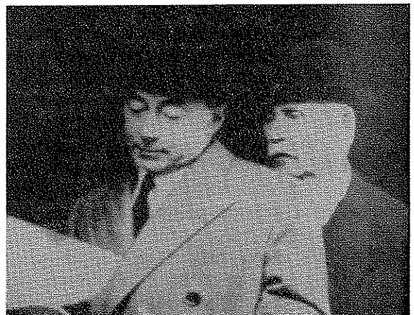
Reynaud and Pétain

Nonetheless, certain political leaders supported De Gaulle's ideas, chief among them being Paul Reynaud, who became the parliamentary champion of the armored corps. Reynaud was convinced France was again preparing for the war that had just been fought, while the Germans were preparing for the war of the future. He earnestly believed