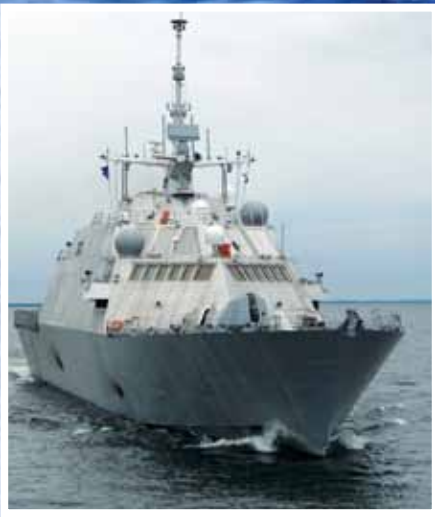
Littoral Combat Ship.

At his swearing-in ceremony as Secretary of the Navy in June 2009, the Honorable Ray Mabus recalled and upheld the conviction of the nation's first Secretary of the Navy, Benjamin Stoddert, who believed that a first-class Navy had to have first-class ships, built in first-class yards. It is toward this timeless goal that the Navy Metalworking Center (NMC) works with its partners in government, industry, and the shipbuilding community to implement innovative yet pragmatic solutions.