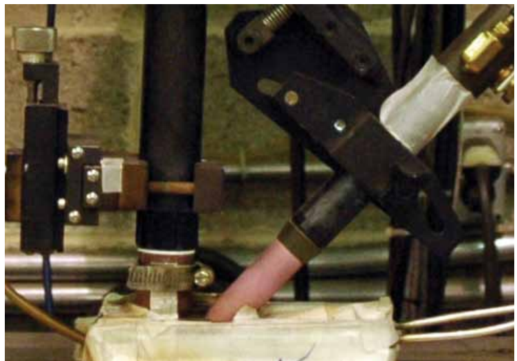
A modified arc cladding process will reduce cycle time and save $1.2 million for the VCS Program.

Based on the results of an NMC-led project, GDEB approved the purchase of a capital request to implement a modified hot wire gas tungsten arc cladding process that will reduce cycle time and allow for $1.2 million in savings over the remaining VCS Program. Currently, the shipyard uses hot wire gas tungsten arc welding (HW-GTAW) in VCS production. The cladding rate of nickel-based materials onto HY-80- and HY-100-grade components is restricted by heat input, dilution rate and interpass temperature limits. This project was developed to evaluate several arc cladding processes, down-select a candidate process and demonstrate the ability to qualify the cladding procedure based on NAVSEA Tech Pub 248 requirements. The developed procedure was based on the present HW-GTAW process with the addition of a supplemental cold wire feed into the arc pool. The resultant process increased the deposition rate from the present level of 7 pounds per hour to 12.8 pounds per hour, achieved appropriate final weld layer chemical composition due to reduced dilution, and met all test requirements defined in Tech Pub 248. In addition to GDEB and PMS 450, NSWCCD and the Institute for Manufacturing and Sustainment Technologies were involved in this project.