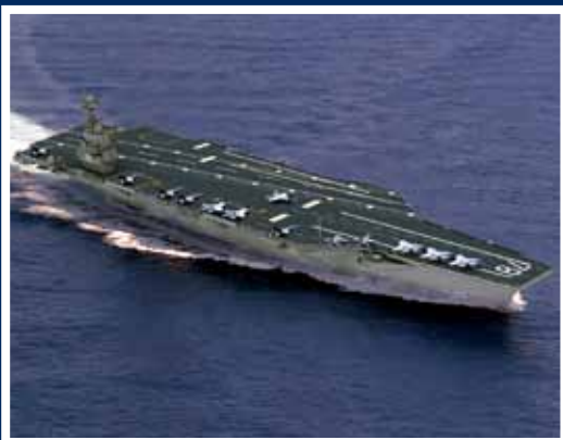
CVN 78.

The Future Aircraft Carriers Program Office (PMS 378) has approved for the construction of CVN 78 the use of a “high-strength, low-alloy” (HSLA) steel that was optimized through an NMC project. NMC worked to increase the performance and strength of HSLA-100 steel through heat treatment and processing to enable use of the new HSLA-115 (115 ksi yield strength) steel at reduced thickness, and thus, reduced weight, while meeting all performance requirements. Implementation of HSLA-115 on CVN 78 will result in 100-200 long tons of topside weight reduction per hull, which will help improve the ship's center of gravity. NGSB-NN procured the first order of HSLA-115 for CVN 78 in March 2009, and construction is scheduled to begin in December 2009. More than 2,000 tons of HSLA-115 will be ordered for CVN 78. Implementation of HSLA-115 was achieved ahead of schedule due to the combined efforts of the IPT, which includes PMS 378, NSWCCD, ONR, NMC, NJC, ArcelorMittal USA and DDL Omni. The team was instrumental in achieving project milestones