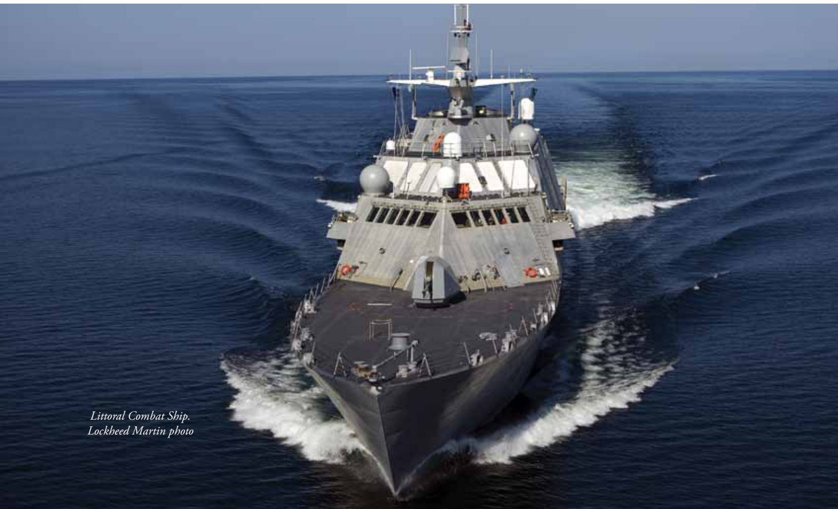
Littoral Combat Ship.

requirements. Current shipbuilding practices available to LCS shipyards are not well suited to producing the intake details. In addition, the intakes are costly to produce in terms of labor and schedule. This project will provide development, testing, and evaluation of several promising design/technology concepts. The manufacturing solutions developed in this project will reduce both the production costs and shipyard duration for construction of the Lockheed Martin LCS. In particular, casting the tunnel entry edge is expected to save significant labor hours in fabrication and installation, improving the yard's ability to produce multiple ships in the fiscal year, as the current shipbuilding plan requires. Shipyard implementation is targeted for summer 2011; however, early insertion may be feasible. The IPT includes PMS 501, LM MS2, MMC, Bollinger Shipyards, ABS, and Gibbs & Cox.