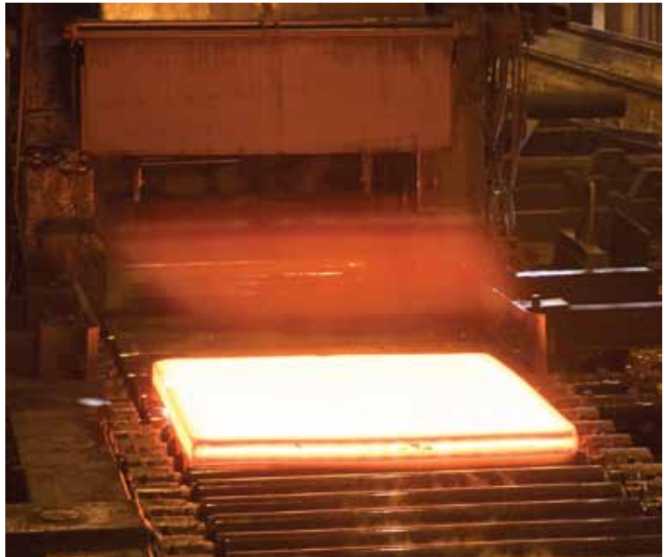
A high-strength low-alloy steel optimized through an NMC project will be used in the construction of CVN 78, significantly reducing topside weight, which will improve the center of gravity of the ship.

CVN 78 is scheduled to enter service in 2015. NMC is contributing efforts to develop manufacturing methods that will optimize the carrier's performance and affordability.