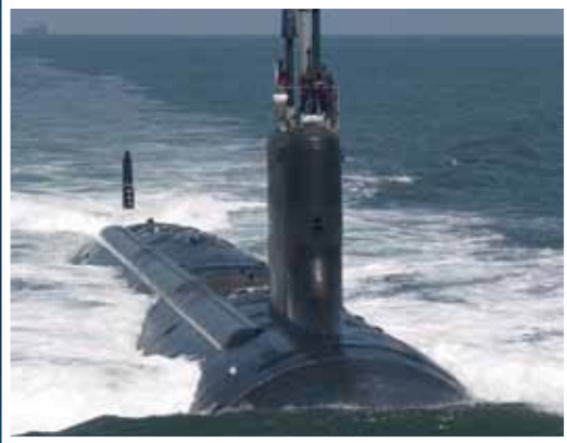
Virginia Class Submarine.

The newest generation of attack submarines, Virginia Class Submarine (VCS), includes many manufacturing and technology advancements that will also reduce total ownership cost over the previous Seawolf class. Toward that end, this class of submarines is being built with a modular design so that new technologies can be integrated without extensive redesign. VCS will incorporate a process called Technology Insertion to implement advanced technologies as they become available. NMC is contributing to several projects that are optimizing manufacturing processes used on VCS.