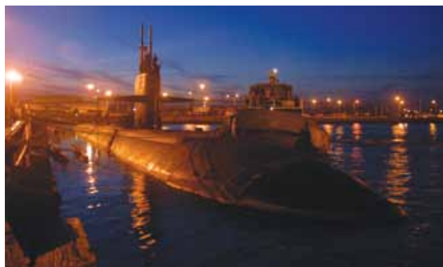
Los Angeles Class Submarine.

GDEB is using several welding tools and simplified inspection methods that were developed in an NMC project for smaller diameter (< 3-inch diameter) pipe details in VCS. Current VCS requirements include off-hull new construction pipe welding methods that involved complex configurations for smaller diameter pipe for set-up, fit-up, fixturing, and pipe welding applications. This project reduced the manual pipe preparation and welding process labor by 20 percent, or 9,000 man-hours per hull, by developing prototype pipe fitting and fixturing tools—a modified Accu-fit pipe tool and a ball pivot welding tool.