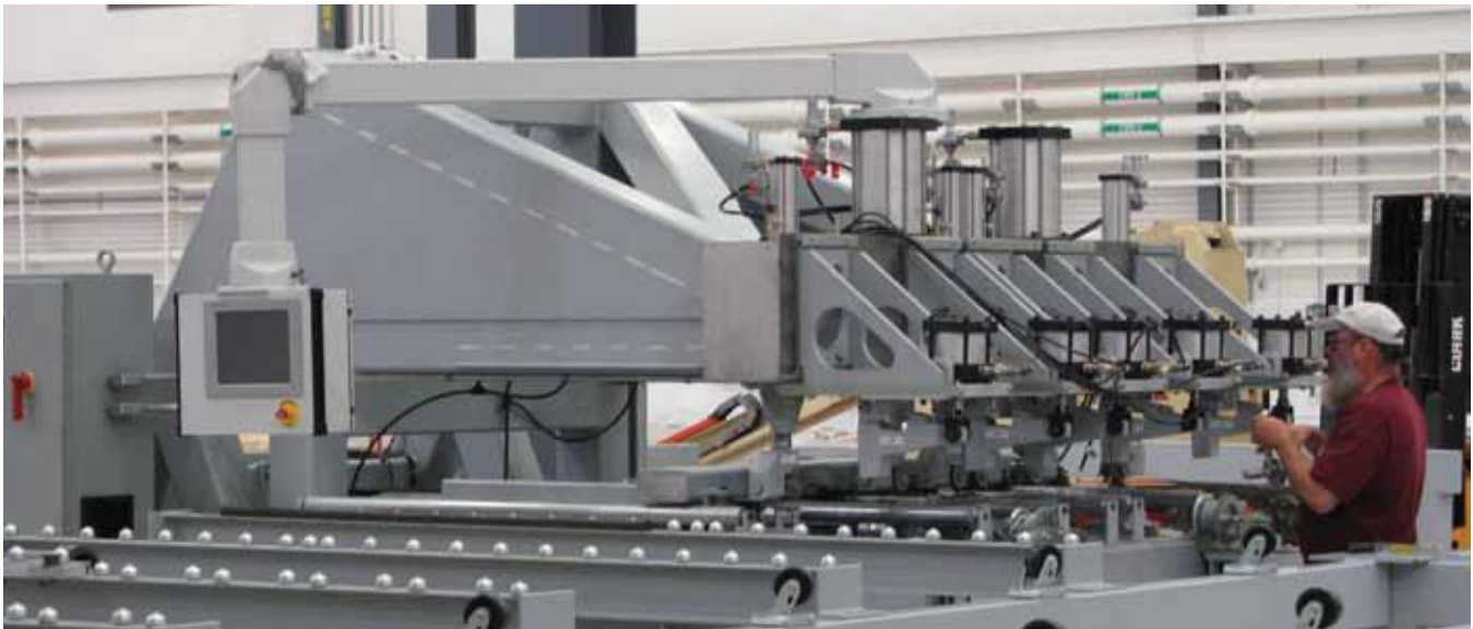
This prototype portable friction stir welding (FSW) machine is less expensive than traditional FSW systems because its functionality is limited to the specific needs of the shipyard. This machine is shown undergoing demonstration testing at the NMC facility in Johnstown, Pennsylvania.

AGS pallet system that will be evaluated by BAE Systems, the project prime integrator. A Technical Data Package of proven manufacturing improvements and cost reductions will be delivered to BAE Systems and NAVSEA PEO IWS 3C for implementation into the Low-Rate Initial Production builds of the AGS pallet system early in 2011. Naval Surface Warfare Center Dahlgren Division and Port Hueneme Division are also providing technical contributions and oversight.