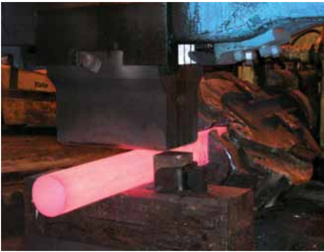
Implementing 15-5PH forgings for critical components of Navy submarines will improve mechanical properties, reduce material costs and eliminate periodic replacement of components.