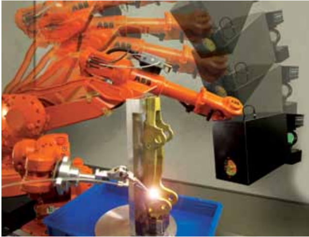
An NMC project is optimizing the laser peening process for potential use on Navy aircraft. Shown is the robotically controlled laser beam, which facilitates uniform peening of large and complex shaped components.

While the majority of Navy Metalworking Center work focuses on the four ship platforms identified in its Affordability Investment Strategy, the Center has been called upon periodically to help address manufacturing needs of Navy aircraft.