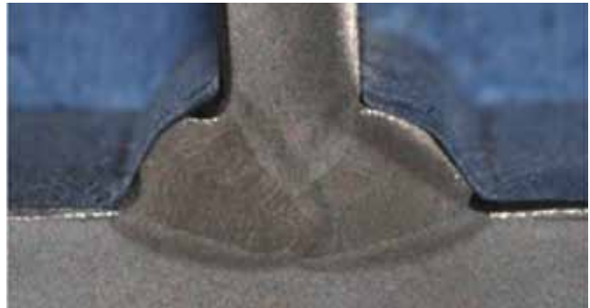
Automated weld seam facing on DDG 1000 ships will reduce costs $750,000 hull due to decreased injury claims and direct labor. This tool is undergoing testing on DDG 51.

The American Bureau of Shipping (ABS), the technical authority for DDG 1000, has approved the use of an