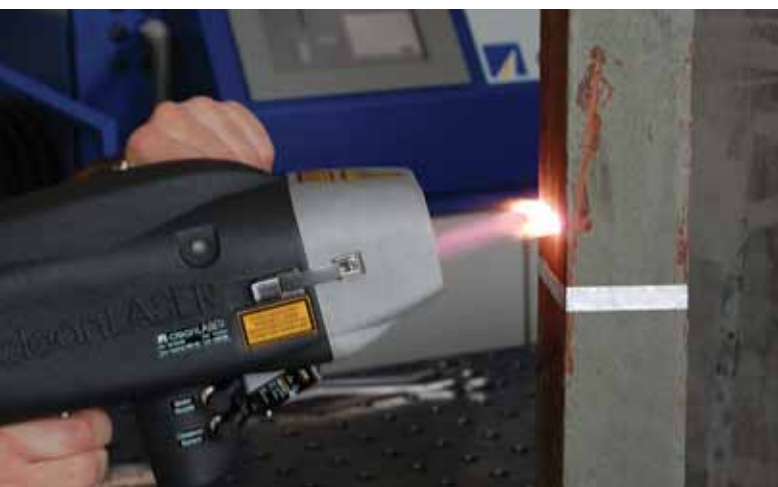
A laser ablation paint removal system will reduce labor costs and secondary waste compared to traditional paint removal methods.

In a project expected to be incorporated into the CVN 68 class carrier maintenance procedures, NMC recently began evaluation of laser ablation technology as a cost-saving and environmentally safer alternative for removing paint. Removal of protective paints is required during in-service inspection, maintenance, and repair of Navy ships. Current paint removal methods are labor intensive and often generate significant amounts of secondary waste, such as used grit, sanding disks, and spent chemicals. Laser ablation technology has been demonstrated to be effective at removing paint without generating secondary waste; the removal of which adds tremendous cost as well as environmental impact. This project will evaluate the latest commercially available lasers to identify a laser ablation process with reduced overall cost and comparable ease of use and removal rate to existing methods. The results of this project are expected to be implemented at NGSB-NN and Norfolk Naval Shipyard in 2012. The IPT includes NGSB-NN and the Aircraft Carrier Maintenance Program (SEA 04XC).