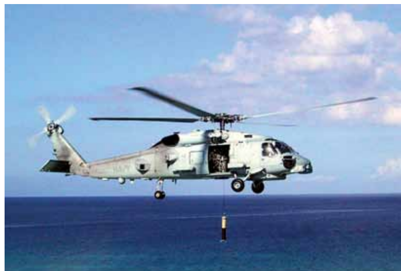
MH-60R "Knighthawk" helicopter. U.S. Navy photo

The Air Vehicle Systems Analysis (AVSA) project addressed design and maintenance enhancements for component, mission kit, and airframe service life of the MH-60R helicopter for the NAVAIR. NMC worked with North Island, Mayport, and Norfolk Naval Air Stations; Cherry Point In-Service Support Team; Lakehurst Naval Air Engineering Station; Lockheed Martin and Sikorsky Aircraft Corporation on this effort. NMC provided design, analysis, material expertise, logistical updates, and maintenance improvements for the aircraft's antenna gasket systems, the tail section stabilator bushings, Forward Looking Infrared/Hand-Control Unit, and airframe production drawings. The technology in this project resulted in reduced fleet support cost, improved maintenance, and higher mission availability for the war fighter.