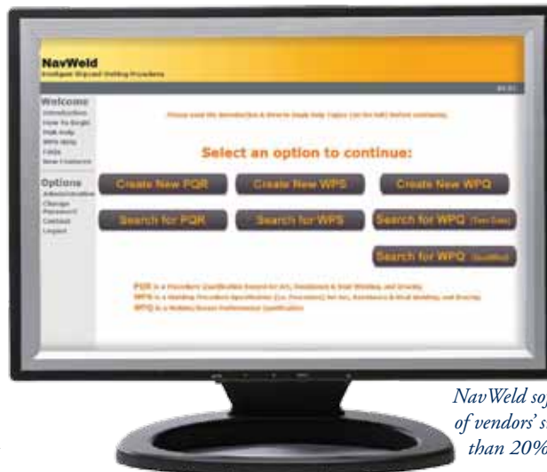
NavWeld software is expected to reduce the rejection rate of vendors' submitted procedures from above 90% to less than 20%, along with the resulting additional costs. WeldQC, Inc., image

WeldQC to extend the use of this software tool to the NGSB-GC operations as well. Initial implementation began at GDEB in September 2009 for the VCS Program. The software system is also applicable to most non-nuclear-related welding on CVN 79, DDG 1000, LCS, Amphibious Transport Dock, and Auxiliary Dry Cargo Carrier.