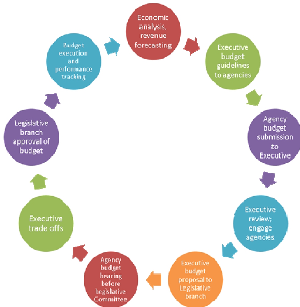
Figure 2. Budget Development Cycle

As seen in Figure 2, the budget development process involves many steps. The strategic planning process is a political, considered, and collaborative approach that is hierarchical (Bryson, 2004). These strategic budgets are developed through lengthy planning and robust examination of service delivery, effective business processes, and measured against desired outcomes and outputs. During the course of such extensive executive reviews, agency stakeholders have the opportunity to engage city and state leadership in examining previous service performance and to make adjustments to the policy, program, or budget as necessary. This process requires the stakeholders and the leadership to be politically astute, rational, and be able to make sound