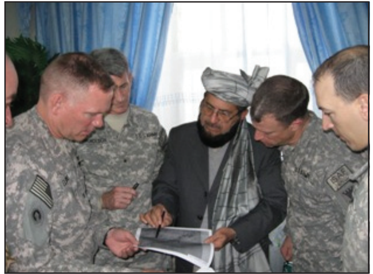
U.S. Army officers meet with Provincial Gov. Del Bar Arman in Zabul, Afghanistan, to plan reconstruction projects.

Another limitation of the first section is the Reconstruction sub-section. The most obvious shortfall of this sub-section is the absence of any mention of PRT interaction with the provincial governor in identifying optimal projects, prioritizing projects, and identifying all potential funding sources, e.g., U.S. Government, host nation, and the international community. Not only are these important tasks, they are extremely difficult responsibilities that require the utmost persuasive skill of the PRT leadership. The PRT commander must ensure that nominated projects are selected and developed in concert with long-term U.S. and host nation goals. These frequently may conflict with or at least not directly align with the parochial whims of the provincial governor. The sub-section further incorrectly states, in paragraph F-11, that the “PRT exists to encourage central ministries to distribute funds to provincial representatives.” 5 This is dangerously misleading. Although such a scenario may occasionally occur, a Provincial Reconstruction Team’s consistent direct dialogue with the central government would likely undermine the legitimacy of the provincial government, especially its governor. Likewise, the entire F-12 paragraph explaining Provincial Reconstruction