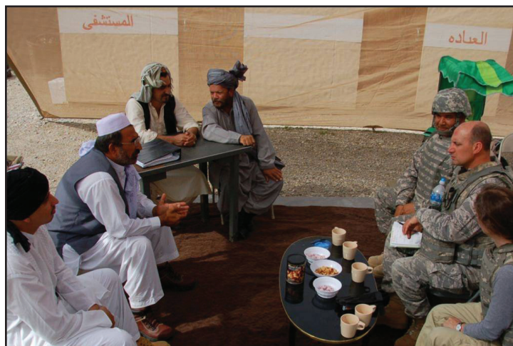
Prior to deployment Provincial Reconstruction Team members train to meet with local province officials to address Commander’s Emergency Response Program projects.

Development Committees (PRDC) is both confusing and too prescriptive. The paragraph should define which level of host-nation officials are members of the PRDC – district, provincial, national, or a combination there of.