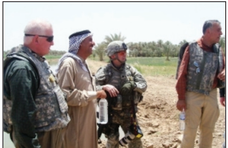
Members of the North Babil Provincial Reconstruction Team discuss plans for creation of an area fish holding pond with a local Sheikh