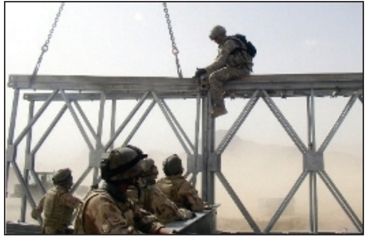
Australian and American Army combat engineers work together to build a replacement bridge in Afghanistan.

The likelihood that the United States, alone or as part of a coalition, will undertake stability operations in fragile of failed states remains as high today as it did a decade ago. One can expect the U.S. Army's participation in Provincial Reconstruction Teams to be part of any successful strategy. Unfortunately, the Army's current doctrine on PRTs contains ambiguity and omissions that detract from its effectiveness. As the body of knowledge on this subject is expanding, the next revision to FM 3-07 needs to overcome these shortcomings.