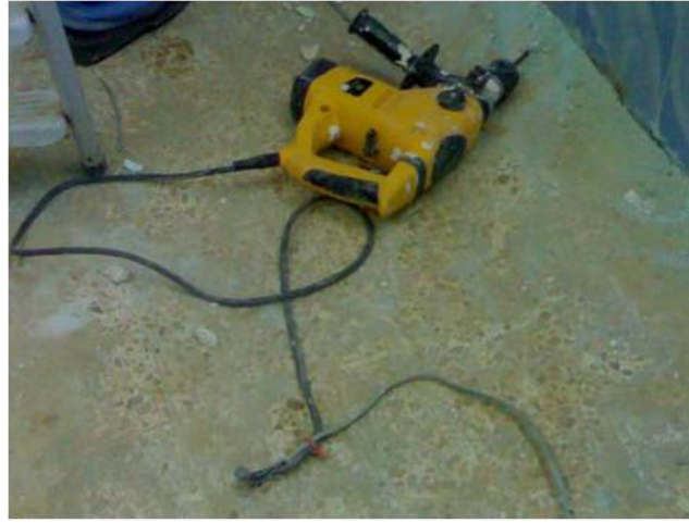
Site Photos 14 and 15. Unsafe electrical practices used by the contractor and captured in daily QA reports