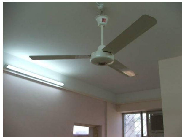
Photos 5 and 6. Views of the hospital administration building interior