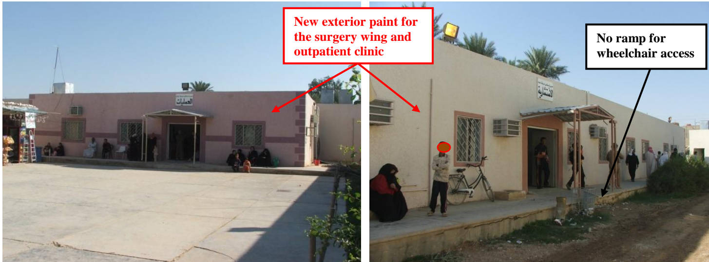
Photos 3 and 4. Exterior of the surgery wing and outpatient clinic buildings

The parking lot had no effective means of channelization or control of internal circulation of traffic. Vehicles were parked in a haphazard manner, which reduced the number of parking spaces available. The parking area was surfaced with dirt and gravel, and had no provisions for surface drainage. Because of the distance from the parking lot to the entrance and the dirt and gravel surface, patients are forced to traverse uneven muddy ground.