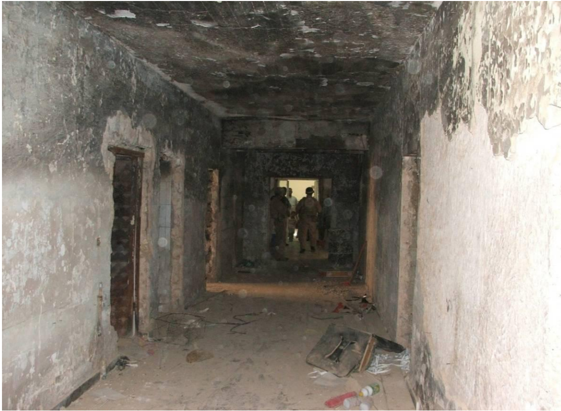
Site Photo 1. VBIED damage to Haditha General Hospital

According to GRC documentation, the justification for this project is that, after renovation and expansion is complete, “this Hospital will be set for 10 years” and will “be a complete day-and-night change for the hospital, allowing them to much better serve their public.”