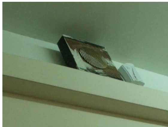
Site Photos 7 and 8. Installation of new wire molding, outlets, light fixtures and new main distribution panels (left) and careless over-painting of intercom system (right).