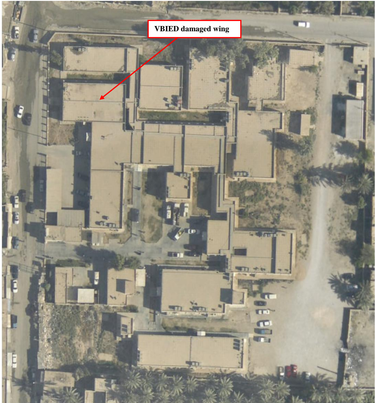
Figure 1. Aerial photo of the Haditha General Hospital

Prior to the war, the hospital was a relatively well-maintained and supplied facility. A lack of many medicines because of the sanctions from the first Gulf War caused the hospital and its community to suffer, but the hospital was fully staffed and the structure was maintained. Also, since 2003, this hospital suffered severely from a lack of adequate funding for repairs and maintenance. In addition, according to hospital staff, insurgents took over the hospital in 2005 to use as a base of operation. This led to the hospital only being able to perform basic care because patients and staff members were afraid and intimidated while insurgents controlled the hospital.