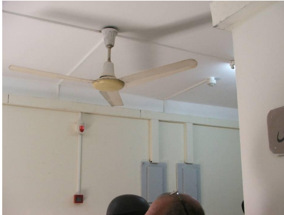
Site Photo 13. Installation of fire alarm system.