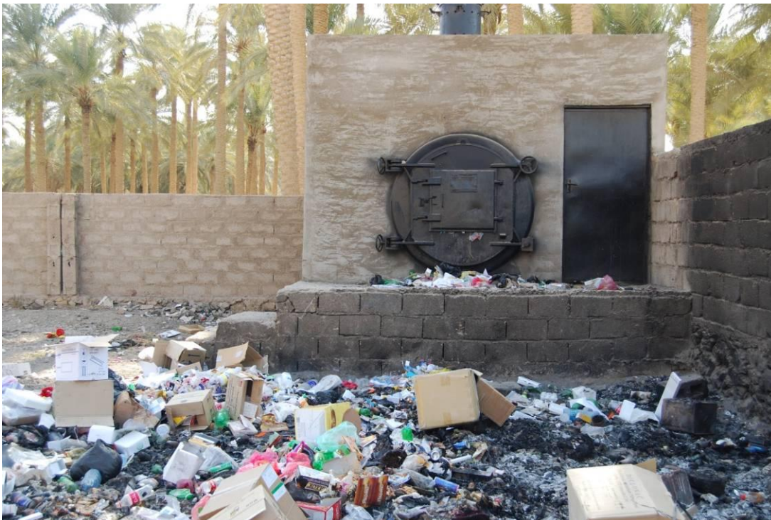
Site Photo 2. Existing hospital incinerator and unsecured medical waste

GRC representatives performed an updated assessment of the hospital in June 2008, which determined that the VBIED explosion and subsequent fire in 2005 devastated the hospital's entire Logistics and Support facility. This left the hospital without a kitchen, laundry, and adequate storage. The hospital is resupplied every six weeks by the Provincial Ministry of Health in Ramadi, which necessitates hospital staff to use patient care facilities as storage, thereby reducing their in-patient capacity from 100 beds to approximately 60 beds. The entire facility is without a working Heating, Ventilation, and Air Conditioning (HVAC) system, leaving patients exposed to cold winter and excruciatingly hot summer temperatures. The operating rooms are old, in major disrepair, and need to be replaced; however, an unstable foundation made repair impossible. The nursery is small, only accommodating two incubators, and needs to be expanded to eight incubators. The radiology facility is separate from the emergency department, out-patient clinics and the operating rooms; therefore, a new centrally located imaging facility is required. The existing laboratory is inadequate for the hospital's requirements and needs to be expanded. In addition, the hospital is in desperate need of a working incinerator because currently there is no means of disposing of biohazards and other dangerous waste that accumulate daily (Site Photo 2).