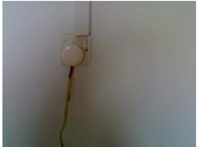
Site Photos 16 and 17. Corrective actions taken by contractor as a result of daily QA reports

GRC's QA program compensated for the inadequate contractor QC program and is ensuring the successful renovation of the Haditha General Hospital.