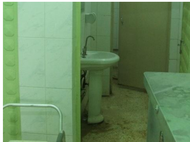
Photos 10 and 11. Heart monitors and defibrillator machines (left) and standing water on the restroom floor (right).