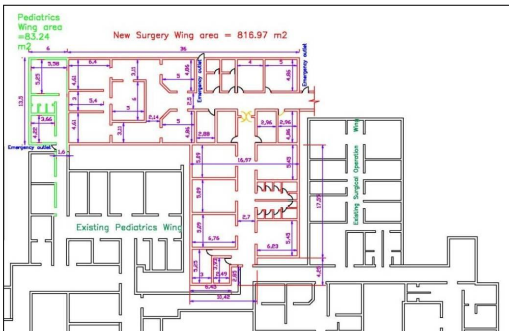
Figure 3. Preliminary floor plan of the new surgery wing addition

At the time of SIGIR's site visit, the contractor had not provided the USACE GRC with the design drawings for the revised SOW. According to USACE GRC representatives, the submittals were more than a month behind schedule and were not expected for at least another two weeks.