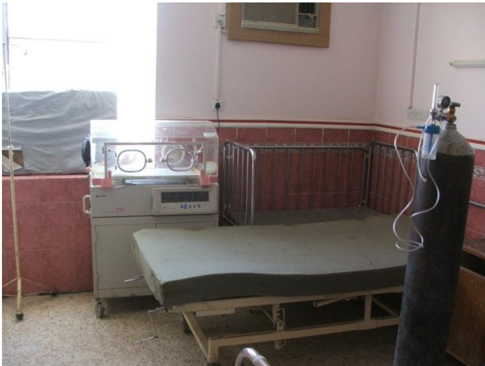
Site Photo 12. Unsecured oxygen tank in maternity wing

The renovation of the wing included an upgrade to the electrical system. SIGIR noted the installation of what appeared to be new wire molding, outlets, and light fixtures.