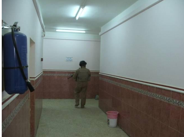
Site Photo 9. Typical ceiling and wall painting and ceramic tile installation.

The patient's rooms have been repainted and the electrical systems have been upgraded. There appeared to be new wire molding installed on the walls, and the light fixtures and ceiling fans appeared to have been recently installed. At the time of the inspection, all of the electrical fixtures appeared to be functioning.