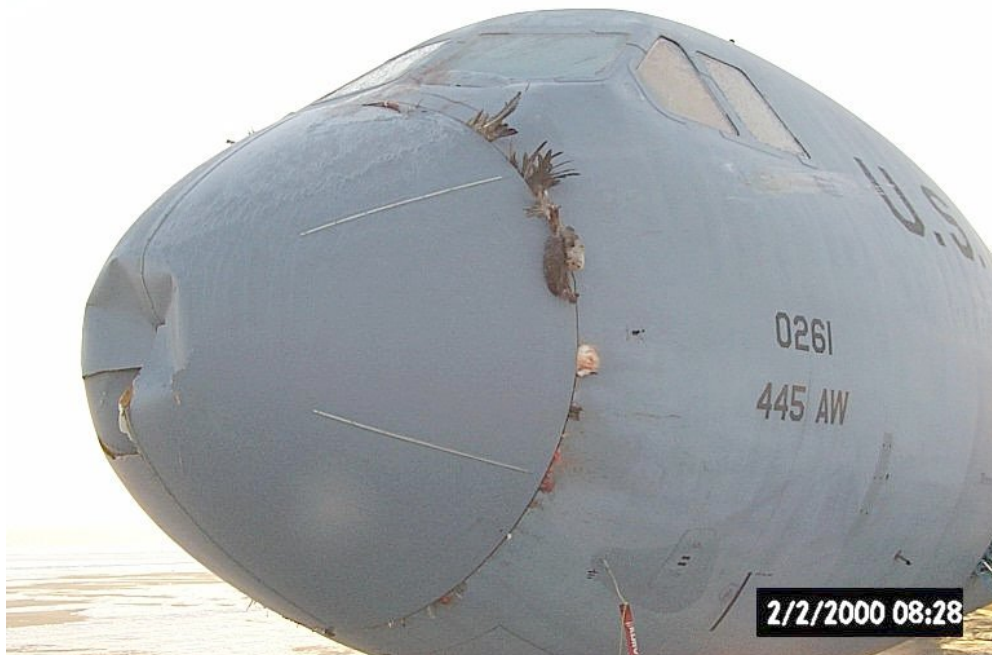
Figure 2. Canada Goose strike on radome of US Air Force C-141.