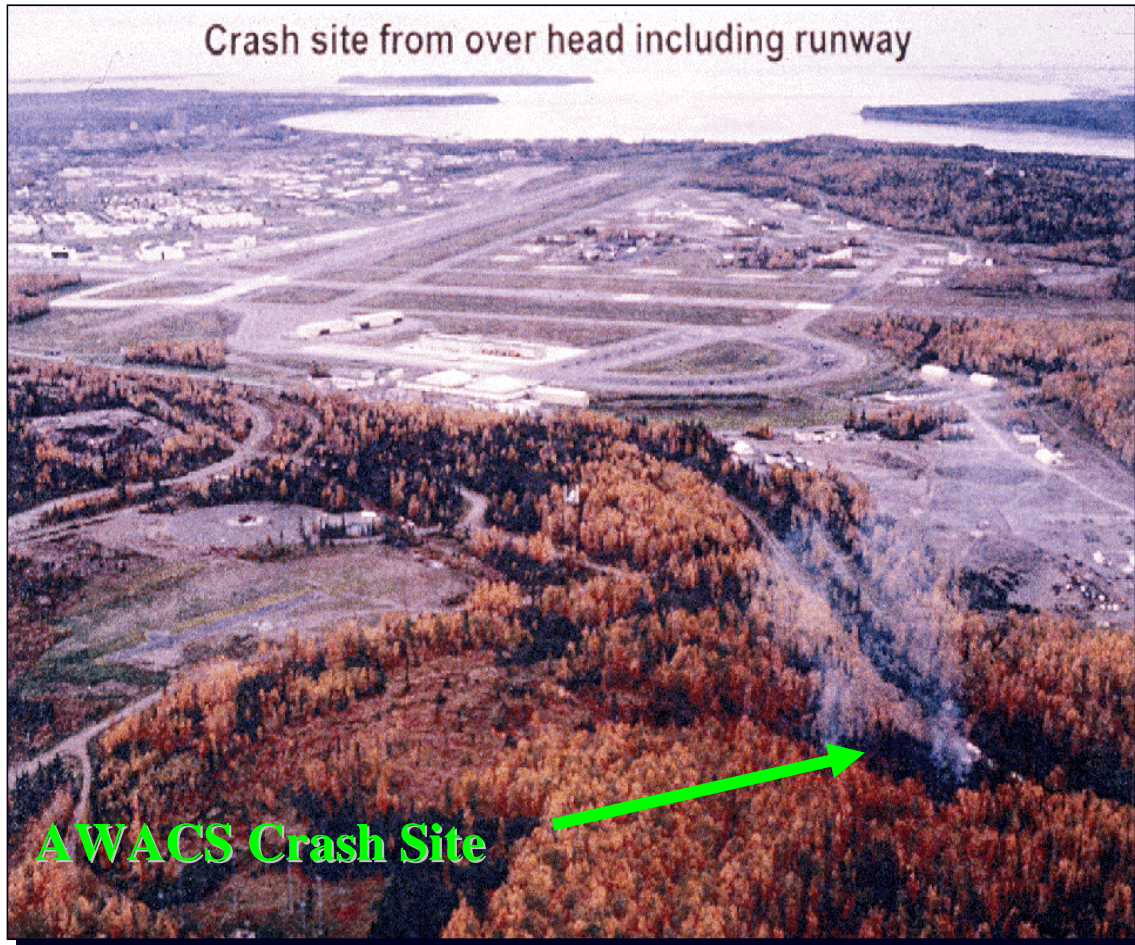
Figure 3. September 1995 AWACS crash from Canada Geese struck at Elmendorf Air Force Base, Alaska.

The US Navy and Marine Corps together report approximately 450 bird strikes annually costing an average of $21.7 million per year in direct costs, including six lost aircraft and two fatalities since 1994. Indirect costs to the US Department of Defense (DOD) are not calculated, but exceed the above values by substantial margins. Aviation industry analysts calculate the total direct and indirect costs to the civil aviation industry at over $1.2 billion US dollars annually. Insurance industry analysts place this figure much higher and conclude costs may approach $4.5 billion US dollars annually for US and Canadian civil aviation alone.