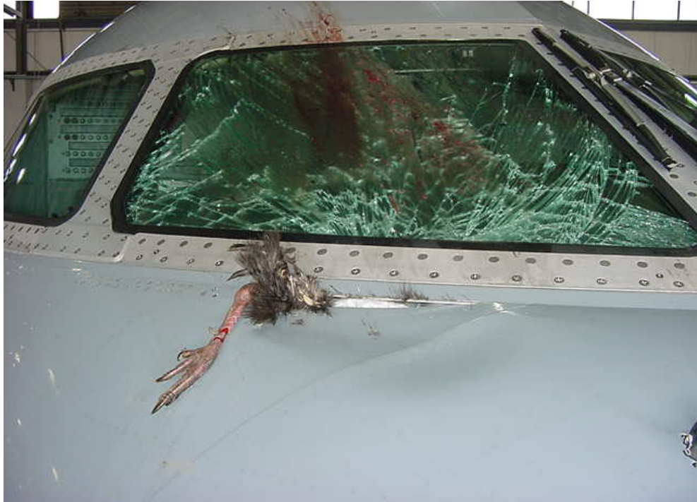
Figure 1. 2002 Turkey strike on commercial aircraft at Dulles International Airport.