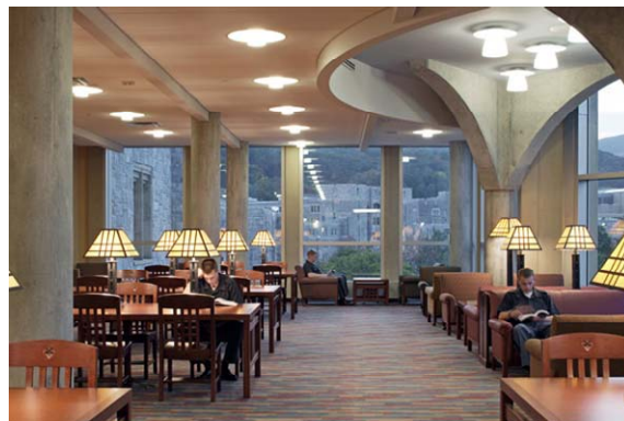
USMA Jefferson Hall

Inspirational space for quiet study with great lighting and comfortable furniture