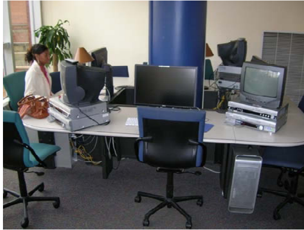
Video editing at Georgia Tech