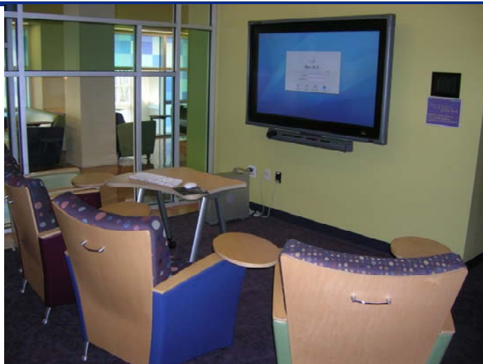
Integrity - Service - Excellence