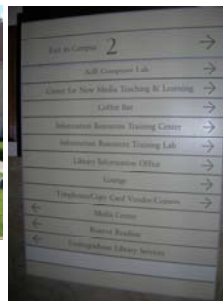
2 nd floor directory