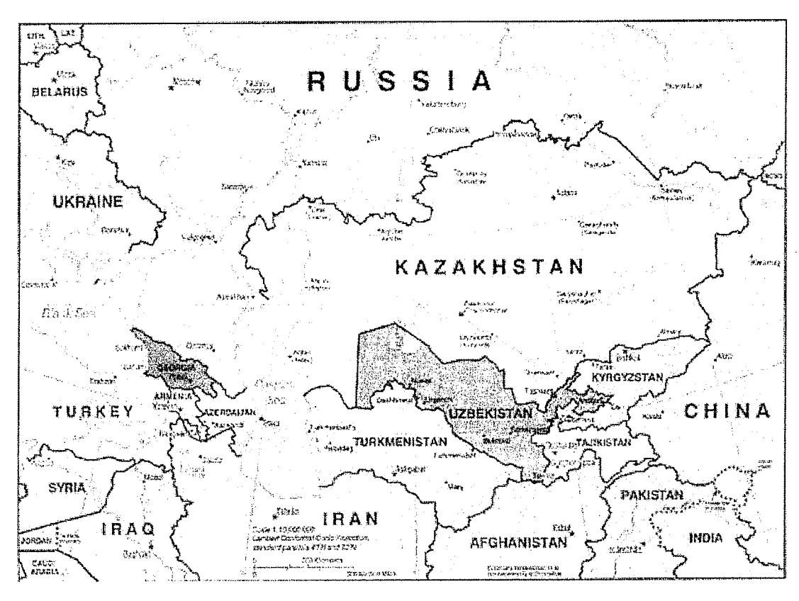
APPENDIX B THE MAP OF CENTRAL ASIAN STATES (CAR)