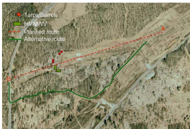
Fig. 2. Assessment configuration for Area B12

The mobility planning technologies were also assessed in a portion of training area B12. Figure 2 shows the area of operations which contains open fields, tree lines, and unimproved trails.