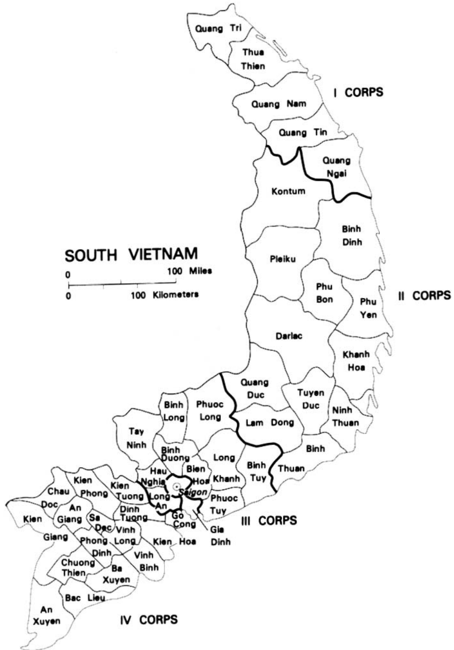
Figure 1: Map of Republic of Vietnam

http://www.history.army.mil/books/Pacification_Spt/Ch1.htm#p2