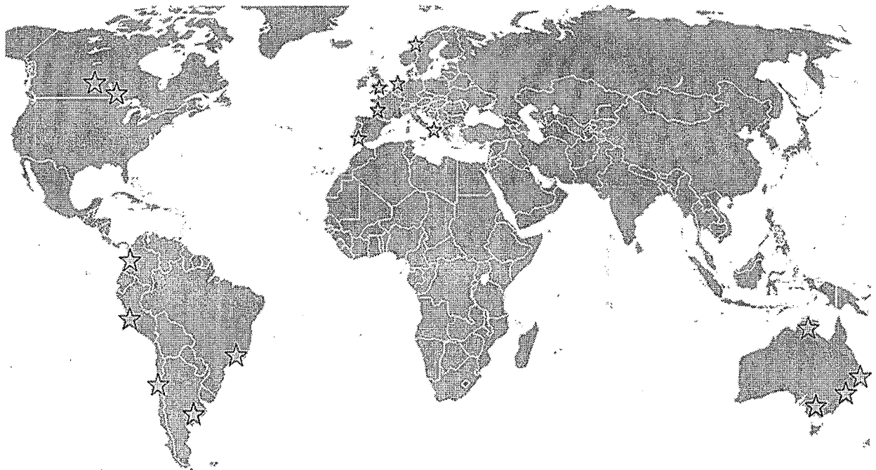
Figure 1: Geographic Laydown of Current Billets (Created by author, modified from http://upload.wikimedia.org/wikipedia/commons/c/c3/BlankMap-World.png )

The intent behind the program is for exchange personnel to function as a regular element of their host service in all respects (with some exception usually due to disclosure issues). Each exchange requires a bilateral Memorandum of Agreement (MOA) that governs the particulars of any exchanges between respective countries. 17