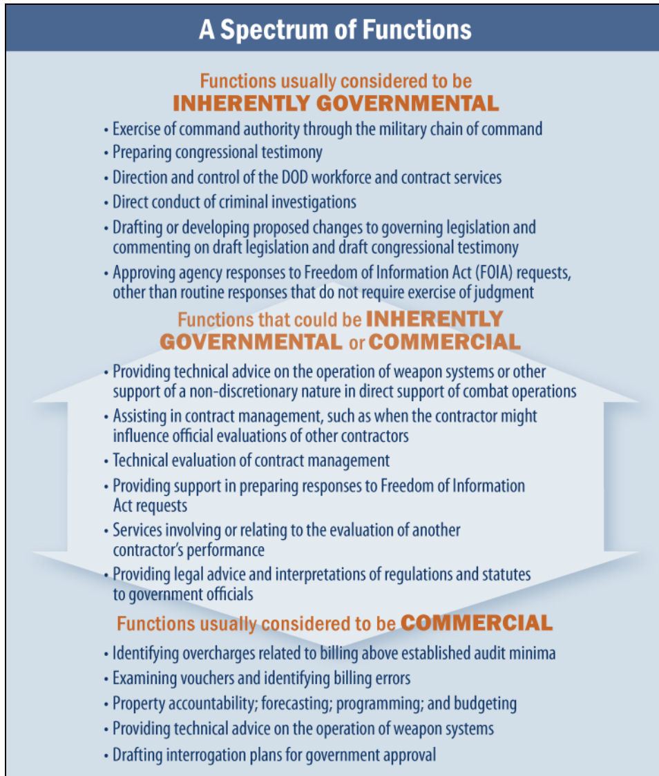
Figure I. Categorization of Functions as Inherently Governmental or Commercial