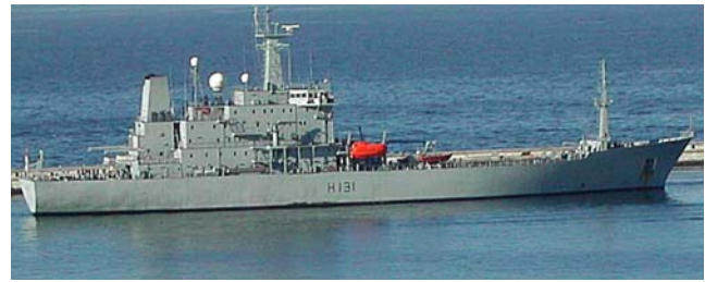
Fig. 1. HMS SCOTT

comprised of four subsystems; Navigation, Sonar, Mission Control and Processing and Power.