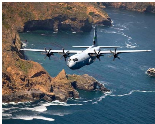
The C-130J Aircraft

No written response to this report was required. Therefore, we are publishing this report in final form.