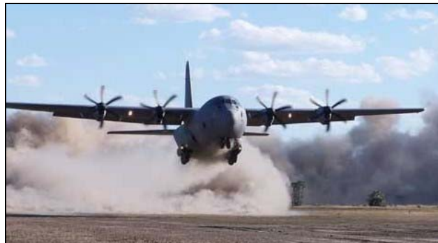
C-130J aircraft on a dirt runway

The following chart is a timeline of the C-130J program as it relates to the MYP contract conversion and the PBD 753 decision to terminate the program. This timeline covers the time from July 2004 to April 2007 and actions taken regarding the C-130J program and the MYP contract.