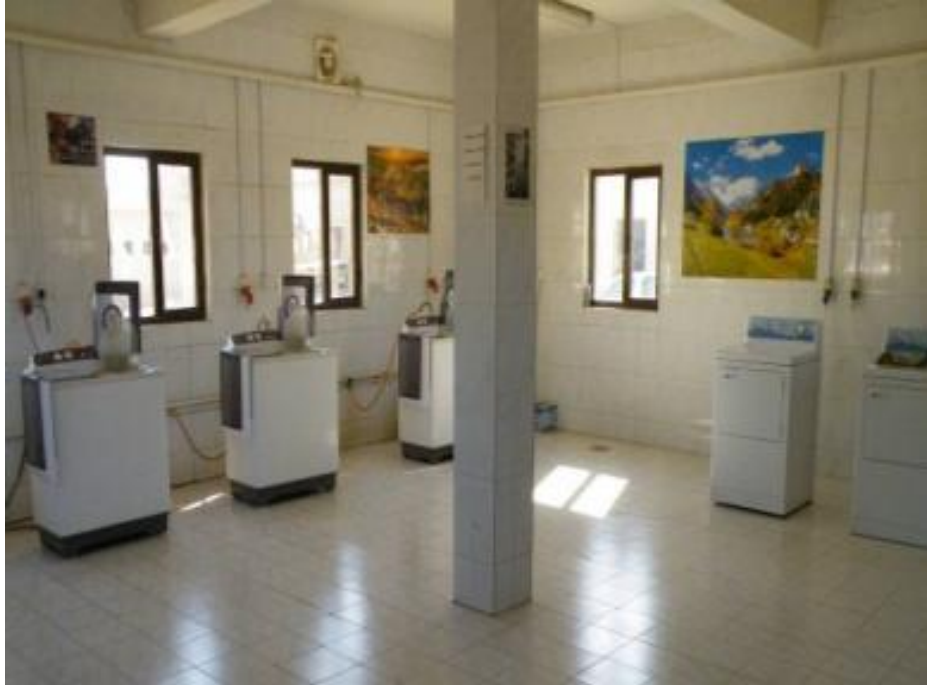
Site Photo 13. Laundry facility interior