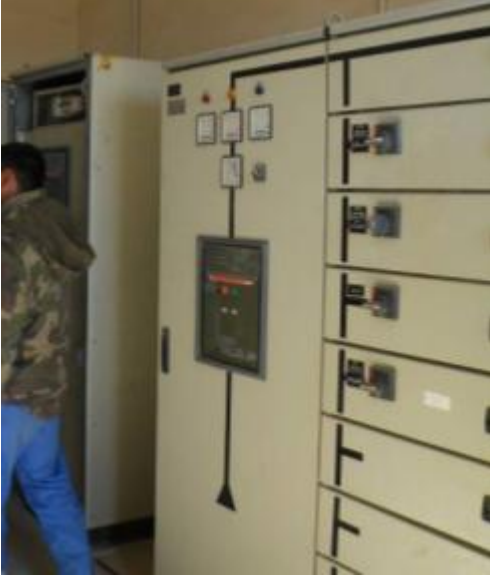
Site Photo 8. Electrical control panels