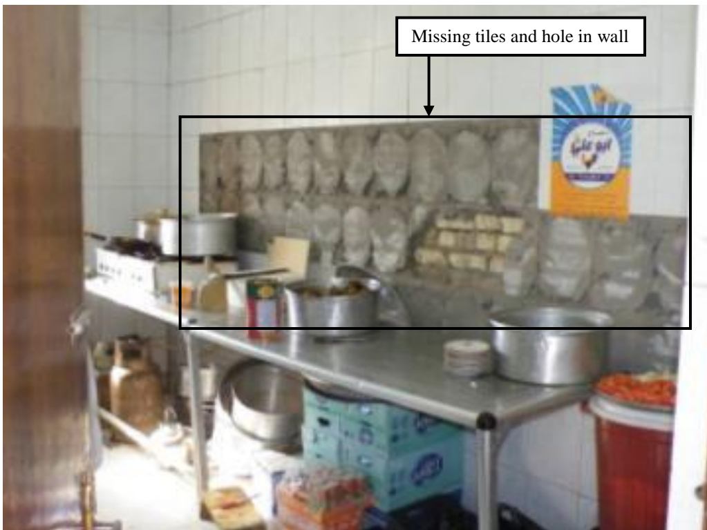
Site Photo 4. Damaged kitchen wall and tiles