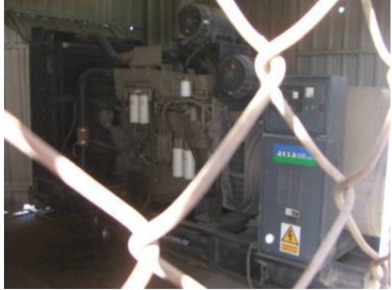
Site Photo 9. Generators