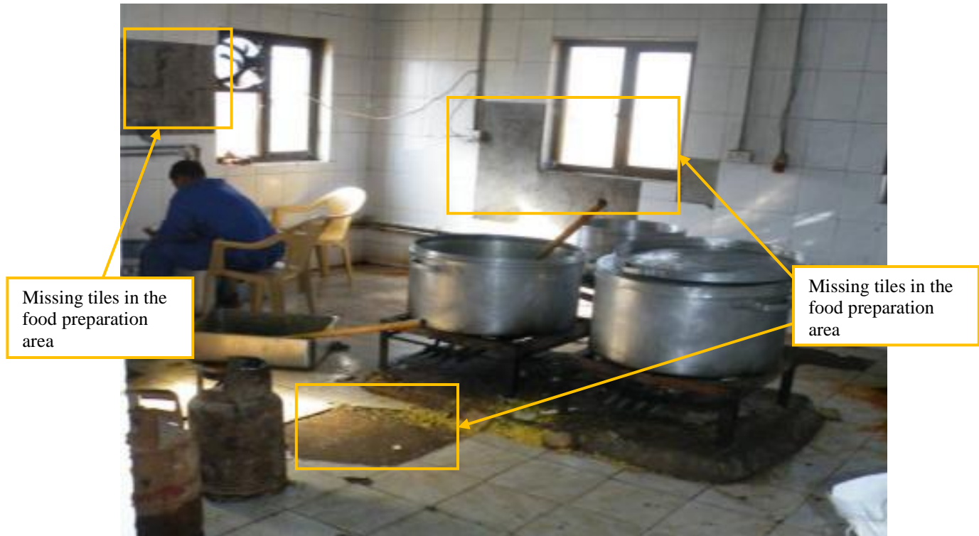
Site Photo 12. Food preparation and cooking area

A separate building was used for preparing and cooking the food. This building was similar in construction, but was not well maintained. For example, wall and floor tiles were missing or damaged, and food, dirt, and debris covered the floor and walls (Site Photo 12). Although the food preparation area was designed for electrical food preparation and heating equipment, no electrical equipment was present. Instead, meals were cooked using portable gas cylinders with open-flame grates. The building appeared adequately constructed.