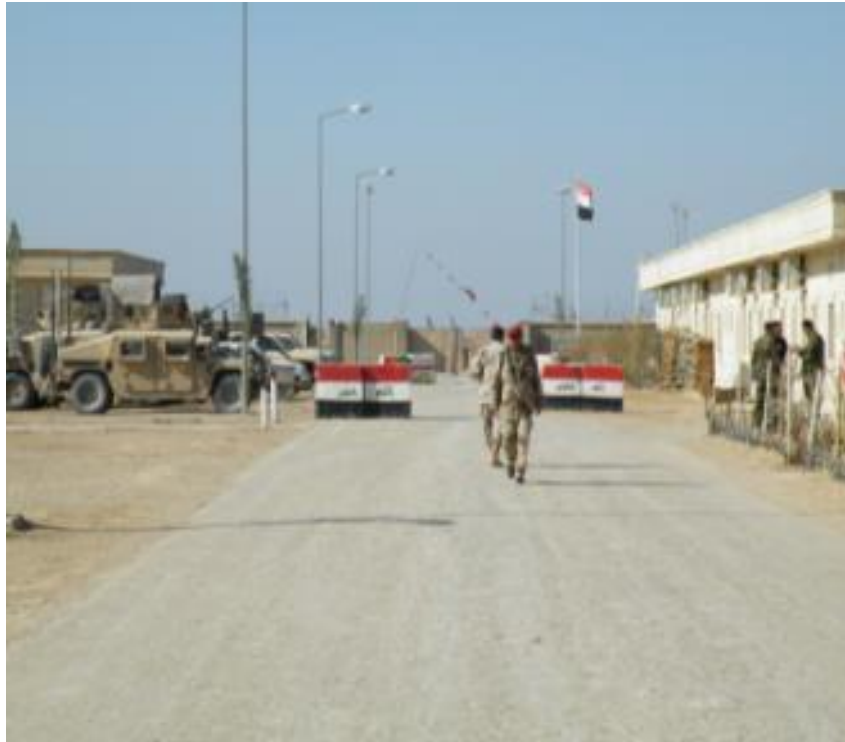
Site Photo 7. Paved road

The contractor was required to construct a 7 m-wide aggregate roadway to connect the new construction with the existing roads. SIGIR observed that the project had paved roadways between the buildings connecting to the main entrance (Site Photo 7). Also, the security lights were to be mounted on 4 m-high poles. During the site visit, SIGIR observed mounted security lights around the perimeter wall.