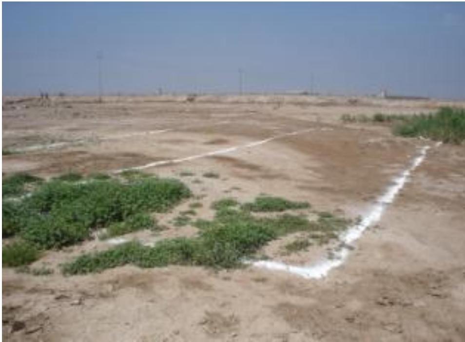
Site Photo 1. Future building location

Before the contractor began new construction at the 4 th Brigade 10 th Infantry Division project, the contractor cleared the area and outlined the future locations of the buildings (Site Photo 1). Site Photo 2 shows the construction of two latrine buildings.