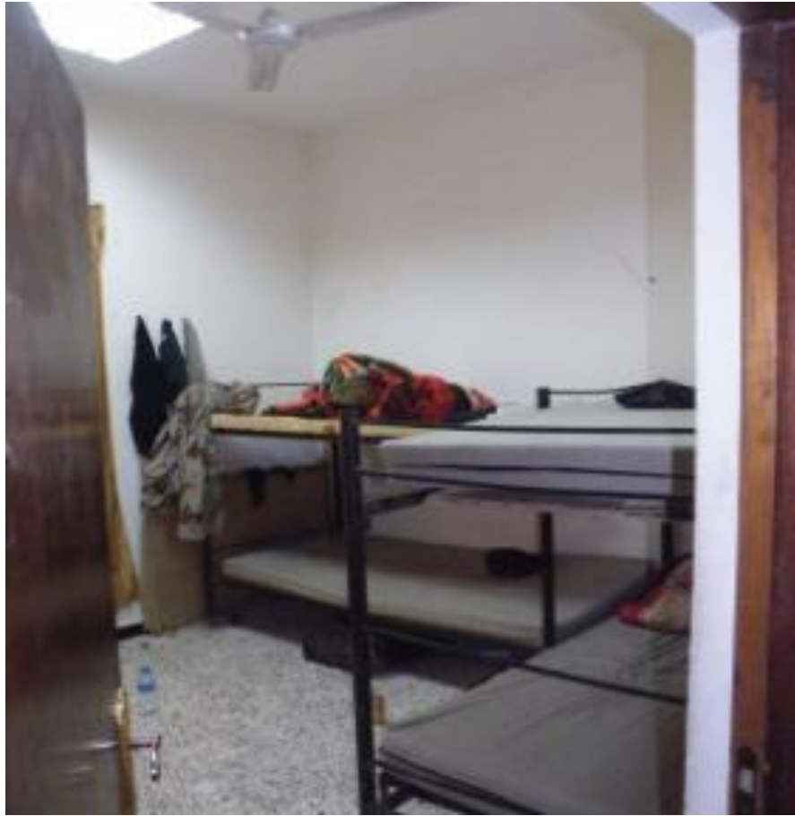
Site Photo 10. Sleeping room