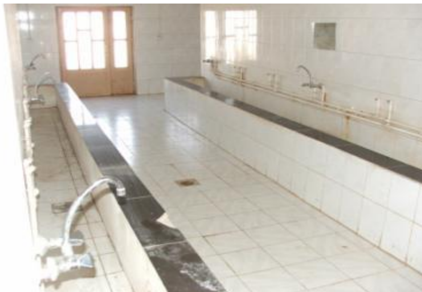
Site Photo 6. Hand-washing station

The SOW stated that the contractor was to construct four 12 x 12.4 m latrine buildings. The facilities would contain 20 water closets, 20 showers, and 28 faucets for hand washing. Site Photo 6 shows the hand-washing area. The restrooms were functional; however, SIGIR observed cracks in the tile, missing and broken faucets, and a lack of housekeeping evident by the level of cleanliness observed.