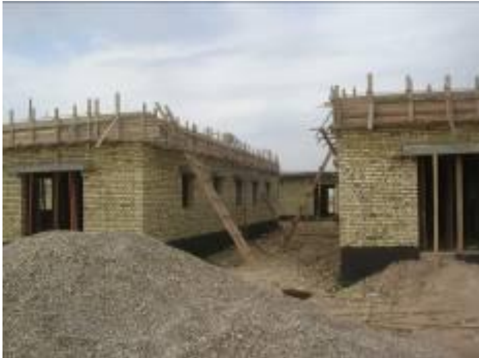
Site Photo 2. Latrine buildings