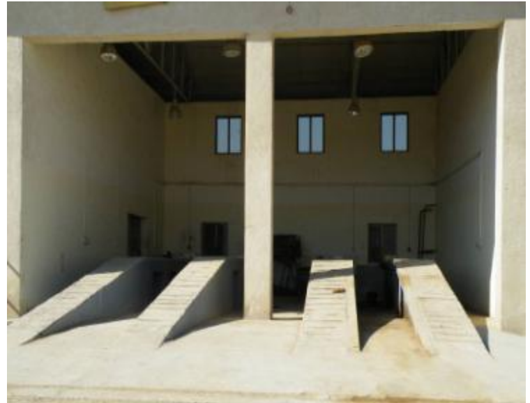
Site Photo 14. Interior medical room with supplies Site Photo 15. Equipment maintenance building