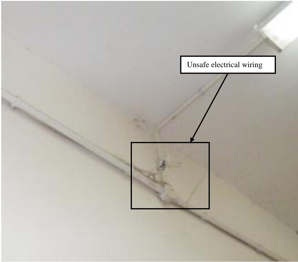
Site Photo 3. Unsafe electrical wiring