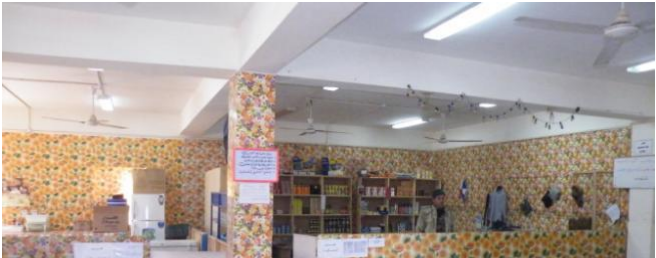
Site Photo 11. Room converted into convenience store