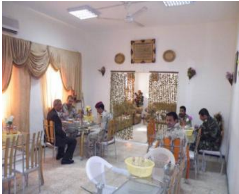
Site Photo 5. Commander's dining area

Because the contract did not provide for furnishings, GRS personnel were not sure if the furnishings were transferred from another facility or purchased by the Government of Iraq. The commander's office and the dining area furnishings appeared functional, but not very durable (Site Photo 5).