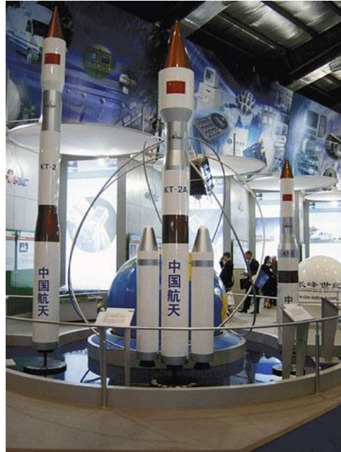
Figure 2. China's KT series of SLVs. The missile used in the January 2007 Chinese ASAT test is likely to have been a KT-1 (right).