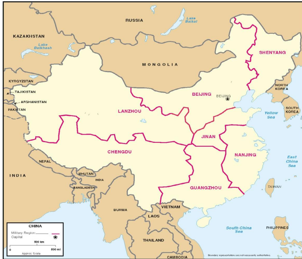
Figure 1. The seven Chinese Military Regions