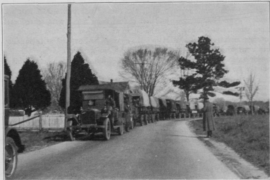
CONVOY CLOSED UP AT A HALT ON THE ROAD BETWEEN RICHMOND AND FORT EUSTIS

When railroad grade crossings were encountered while marching, two men from a leading vehicle in each battery, were posted as watchmen. They took posts on the tracks, one a look-out in one direction, the other, in the