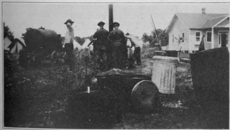
"B" BATTERY SETS UP OUTSIDE OF LANGLEY FIELD, VIRGINIA

4. The duties of the Service Battery will be limited solely to supply