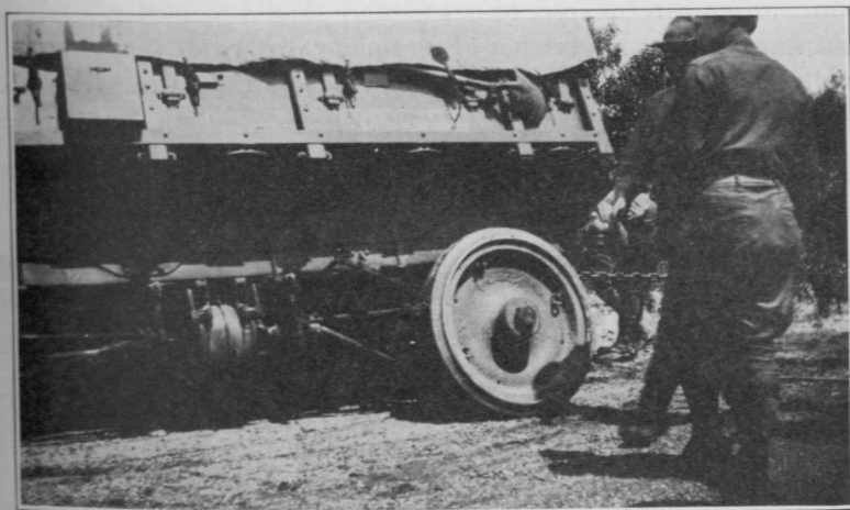
C. T. TRUCK IN DITCH OUTSIDE CAMP MEADE, MARYLAND

All of our billeting areas were located from one to five miles off the main highway routes which we had planned to follow. From automobile