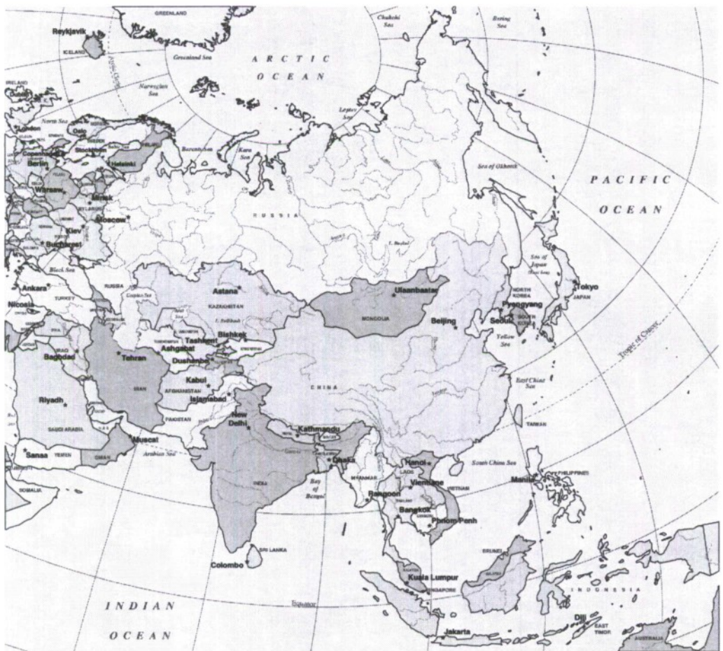
Figure 1: Map of Asia