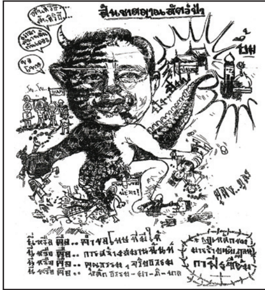
Figure 2.3 Leaflet Portraying the Thai State as a Rapacious, Anti-Islamic Entity