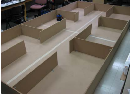
(a) Field of operations. The experiment is housed in an 8 ft. x 16 ft. field designed to mimic an indoor environment consisting of a hallway with three rooms on either side. The walls are 12" tall, and the top is open.