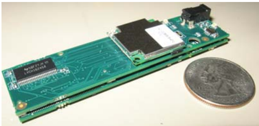
(b) Gumstix processor and wireless card with embedded linux. The Gumstix is a 400 MHz Intel XScale ARM-based processor with 64MB of RAM and 16MB Flash memory running embedded Linux 2.6.18 with the \mu Clibc library