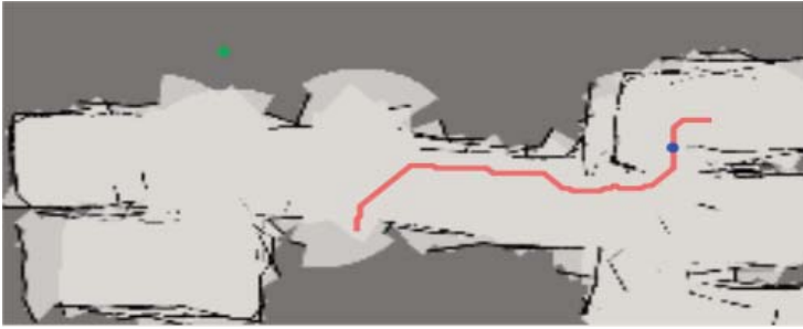
Figure 2. Path (red) planned collaboratively by six robots. Each robot contributes input to the global map based on its local sensor readings.

C. Sensor Fusion. The detailed results make it clear that no one sensor modality is sufficient for path planning and navigation. Robots without whiskers routinely run into walls. Sonar provides a broad view of the environment, but suffers from disastrous reflections at corners. IR has a narrower beam, but takes longer than sonar to perform an azimuthal scan, and suffers from specular reflection at smooth surfaces such as metal braces. We use "hacked" optical mice to provide inexpensive odometry. An optical mouse has an excellent camera / lens / processor built in. We mount two of these under the robot, aimed at the floor. Each mouse provides delta-x and delta-y output in a serial bit stream. Using this combined data, we can measure the robot's linear and rotational velocity to perform dead reckoning. However, as with all dead reckoning, errors accumulate and must be corrected.