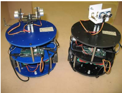
(c) Two of the six mobile robots. Sensors include sonar, IR, dual video, and contact (whiskers). Each robot is 7 inches in diameter and 12 inches tall.