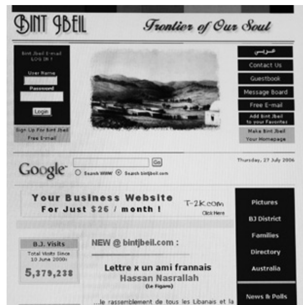
The Bint Jbeil website depicts a village in southern Lebanon and the scene of fierce fighting between Israeli soldiers and Lebanese-based Hezbollah guerrillas, 27 July 2006.

To do their jobs, journalists employed both the camera and the computer, and, with the help of portable satellite dishes and video phones “streamed” or broadcast their reports..., as they covered the movement of troops and the rocketing of villages—often, (unintentionally, one assumes) revealing sensitive information to the enemy. Once upon a time, such information was the