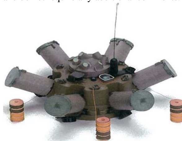
Spider Munition Control Unit

The Project Manager, Close Combat Systems and the Director, Headquarters, Defense Contract Management Agency responding for the Commander, Defense Contract Management Agency, Munitions and Support Systems, Picatinny Arsenal, New Jersey; and the Commander, Defense Contract Management Agency, Boston, Massachusetts, concurred with our recommendation. We consider the concurrences responsive to our recommendation and do not require any additional comments.