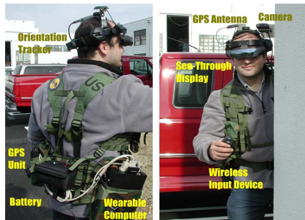
Figure 2: An annotated view of the hardware configuration of the current BARS prototype.

A channel contains a class of objects and distributes information about those objects to members of the channel. Some channels are based on physical areas, and as the user moves through the environment or modifies the spatial filter, the system automatically joins or leaves those channels. Other channels are based on semantic information, such as route information only applicable to one set of users, or phase lines only applicable to another set of users. In this case, the user voluntarily joins the channel containing that information, or a commander can join that user to the channel.