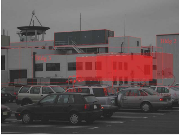
Figure 3: A sample protocol to show the location of occluded objects. The first three layers are shown with outlines of varying styles. The last three layers are shown with filled shapes of varying styles.