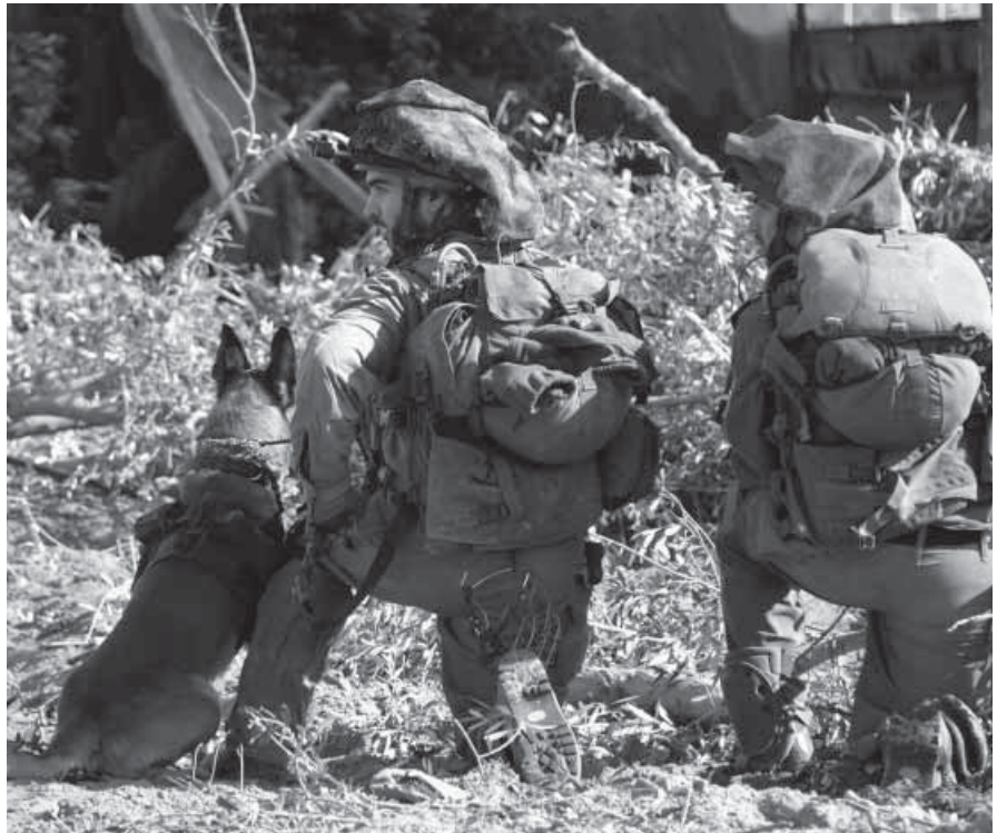
Figure 3. An IDF Oketz K-9 team.

The IDF entry into buildings was effected by breaching (blowing or knocking holes through walls) thereby avoiding potentially booby-trapped doors and windows.<sup>50</sup> Booby traps, IEDs, and ambush sites were further mitigated by the liberal use of heavily-armored D-9 bulldozers to create corridors through buildings and walls. This had the added benefit of negating Hamas's planned fields of fire and the required line of sight for successful employment of RPGs and ATGMs. Considering the scope of the operation, its tempo, the complex urban environment, and the inherent advantage of well dug-in defenders, the relatively small number of IDF or collateral civilian casualties is remarkable. This is attributable to the lessons from the Second Lebanon War being wellheeded by the IDF and subsequent development and enforcement of effective force protection measures.