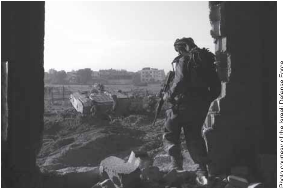
Figure 4. Example of a D-9 bulldozer created corridor through a building wall.

Information operations (IO) will receive comprehensive coverage in a separate chapter, however a few points warrant mention in this section. The IDF took extreme, but not unprecedented, measures to augment operational security (OPSEC) and exert some modicum of control over the media. Firstly, the IDF confiscated the cell phones of soldiers involved in the operation. Second, the international media was barred from entering the Gaza Strip once hostili-