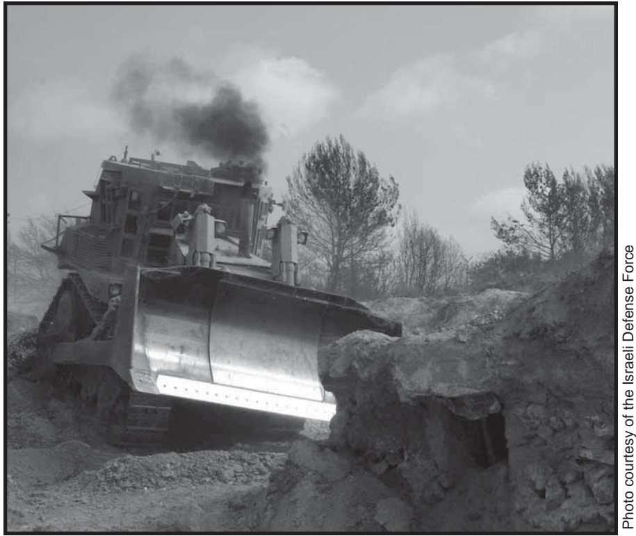
Figure 2. IDF D-9 Bulldozer during Operation CAST LEAD.

the spear" supported by infantry. In fact a new "tank" appeared—the heavily armored Caterpillar D-9 bulldozer which was used to create new avenues of approach that bypassed likely ambush sites, mine fields, IEDs, and pre-chambered demolitions (the feared "belly mines" that destroyed two IDF tanks in the Second Lebanon War).