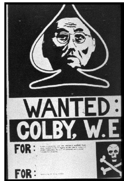
William Colby pictured on a poster attacking the Phoenix program. Date unknown.

The PRUs became probably the most controversial element of Phoenix. They were special para-