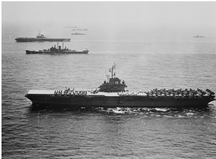
A planned NATO exercise, involving US Navy aircraft carrier battle groups shown here, allowed British and French warships to enter the region without drawing undue attention.

Thus in the late summer of 1956, the British were confronted with the very real possibility of having to fight a politically unpalatable war to repel an Israeli invasion of Jordan. Troops and aircraft for such a contingency would have to be assembled on Cyprus. This provided an ideal cover for the buildup for the