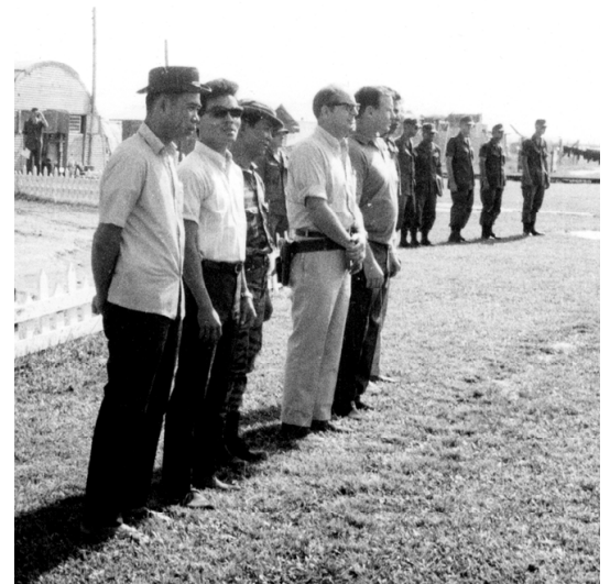
Formal military formations were rare in Tay Ninh. In this case, four members of the PRU were awarded Bronze Stars for bravery during an operation with the US Army’s 25th Infantry Division.

While my experience in Tay Ninh does not necessarily represent the experience of other PRU advisers and their units, I can say confidently that the Tay Ninh PRU was successful during my tour. From September 1969 to June 1970, the Tay Ninh PRU