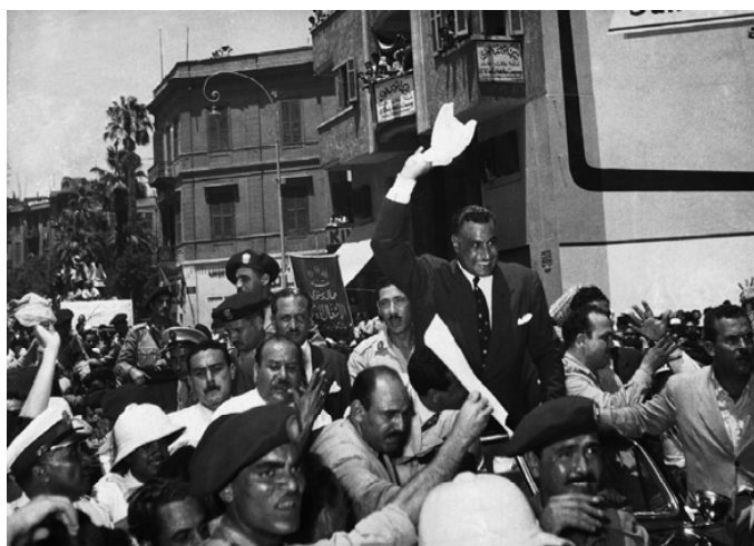
Egyptian Prime Minister Nasser cheered in Cairo after announcing takeover of the Suez Canal Company, 1 August 1956.

Neither Israel's self restraint nor Nasser's discretion proved to be as great as the Middle East experts thought. They may also have thought Nasser had more control over events along the Egyptian-Israeli frontier than he actually possessed. The estimators almost certainly underestimated the ability—indeed the likelihood—that Israeli intelligence would reach the same conclusion about Nasser's future attitude that they had.