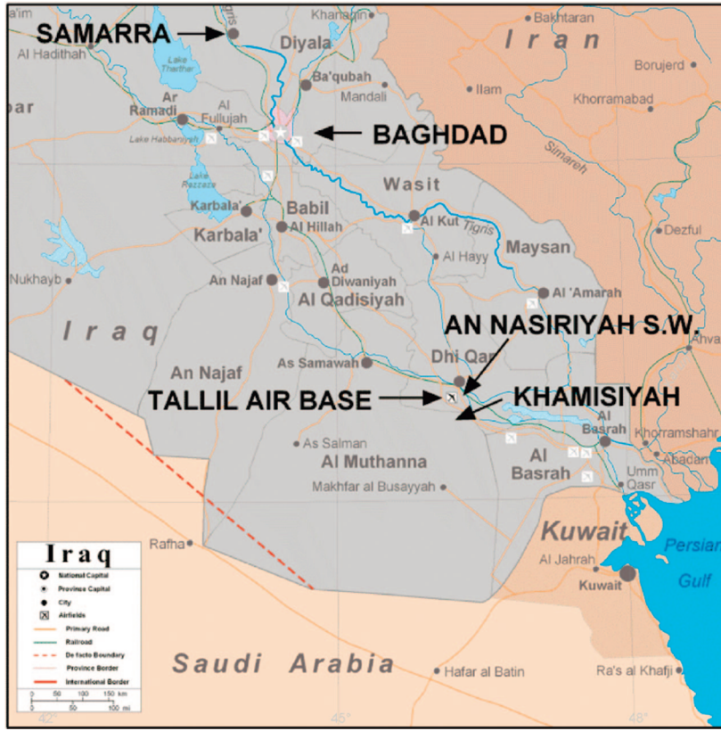
Fig. 1. Map of Iraq and Kuwait showing the location of TAB in relation to Baghdad and Kuwait City.

of semiarid desert (Fig. 2). The terrain is flat with <1-m natural variation in elevation over the 30 km 2 of the base. There are no natural sources of water (e.g., streams or ponds); however, there is a network of abandoned irrigation canals that hold water during the infrequent rains. Conditions at TAB were best described by an airman assigned to the 407th Air Expeditionary Force: