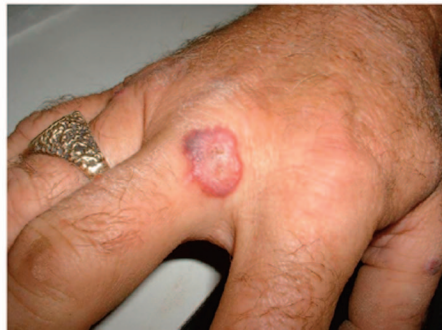
Fig. 5. Typical sand fly bites acquired during a single night on U.S. military personnel stationed at TAB in 2003.

dust occur frequently and adversely affect all activity (human and sand fly). The impact of environmental factors (temperature, wind speed and direction, relative humidity, cloud cover and moon phase) on sand fly activity will be evaluated in a subsequent article.