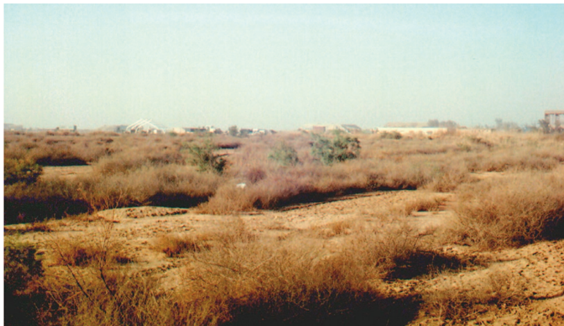
Fig. 2. Typical topography and environmental features found at TAB.

“Everything that does not move is covered in a grayish brown, powdery dust. The heat is oppressive—>120 degrees in the shade, and the open fields and roads bear craters large enough to swallow small trucks. In March 2003, the area around TAB looked more like the surface of the moon than the bustling tent city and flight-line area standing today. After the base fell to coalition