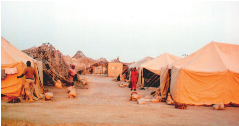
Fig. 4. Tents belonging to a U.S. Army unit stationed at TAB (June 2003). Note the lack of air conditioners on the tents.

18.9 cm of precipitation. Measurable precipitation occurred on 26 of 558 d during this period. Maximum daily temperatures in the summer (May–September) average above 45°C and exceed 50°C on occasion, with nighttime temperatures averaging 25°C in the summer and 0–10°C in the winter. During 2003 and 2004, the maximum daily temperature exceeded 37.8°C (100°F) on 160 and 162 d, respectively. During the summer, late afternoon storms with high winds and blowing