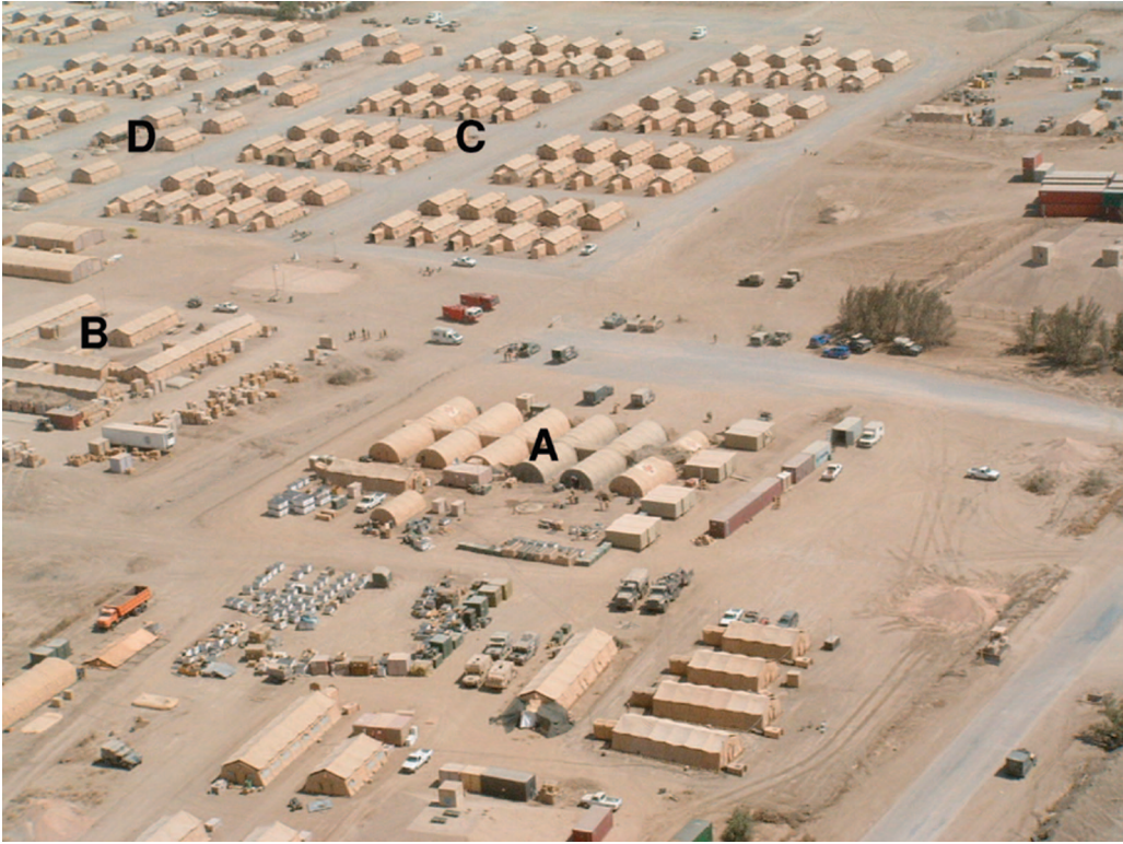
Fig. 3. Aerial view of the U.S. Air Force facility established at TAB in May 2003, including (A) hospital, (B) central dining facility, (C) air-conditioned living quarters, and (D) shower tents and latrine tents.

forces during Operation Iraqi Freedom, the landscape was desolate, save a few abandoned buildings, many of which still had extensive damage remaining from the first Gulf War” ( http://www.globalsecurity.org/military/world/iraq/tallil.htm ).