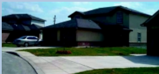
More than 420 new homes for enlisted service members E-3 to E-7 are nearing completion at Lackland AFB. This was DoD's first housing privatization project.