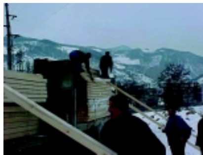
AFCAP was used this winter to procure emergency lumber for Kosovo residents.