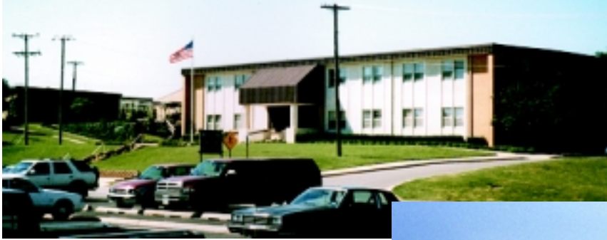
The 507th Air Refueling Wing Headquarters building, before and after power lines were laid underground.