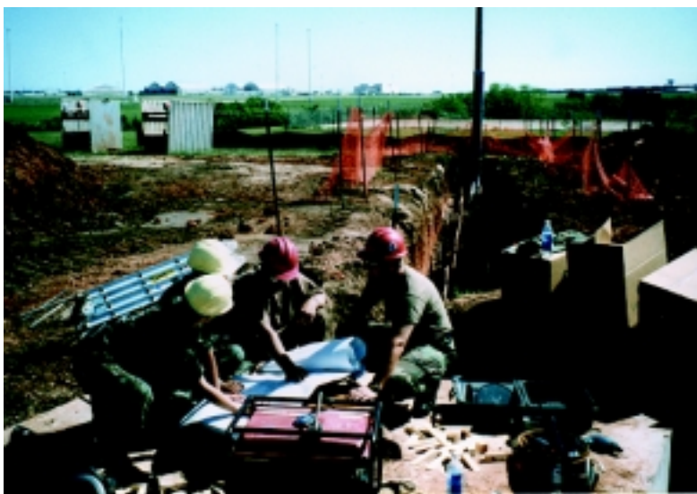
507th CES and 307th RHS members consult project blueprints for a final check prior to encasing the conduit in concrete. Ultimately, laying the power lines underground involved trenching nearly three-quarters of a mile on Tinker AFB.