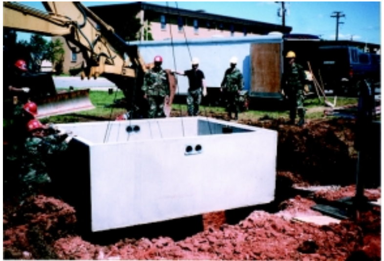
Project team members place the bottom section of a concrete manhole into the ground. This section, weighing roughly 6 to 7 tons, was pre-cast in Texas and shipped to the site.

Another unique aspect of this project was the wide variety of members participating. On most civil engineer deployments, you are likely to see electricians helping pavement specialists when it's time to do a large concrete pour, or swinging a hammer alongside carpenters. This time the shoe was on the other foot,