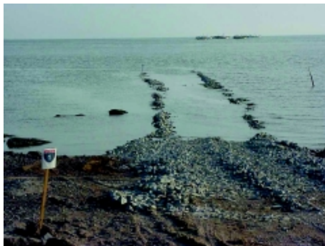
Extreme tide fluctuations allowed only short periods for removing the CBU. Construction of a road, dubbed Red Devil Route 1, into the Yellow Sea allowed quick access to the recovery site during low tide.

On the video, the fuze appeared to be separated from the dispenser fin by about 100 feet. Our worst fear was that the CBU had opened and there could be 202 small bomblets on this tidal flat — if that were the case, the team would be