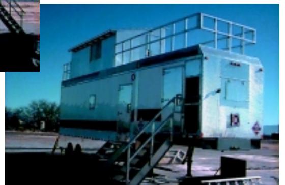
Exterior views of the new structural fire-fighting simulator, which provides more realistic challenges and more safety features for firefighters.