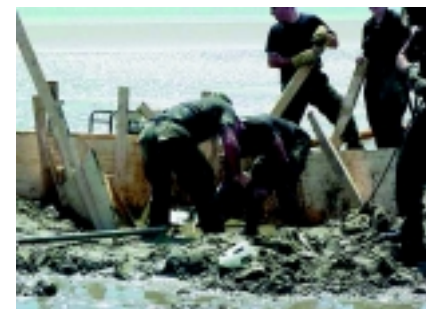
(left) Before building Red Devil 1, the 8th CES EOD flight tried to use HMMWVs to haul equipment to the recovery site, but to no avail. (center) The EOD team and CE volunteers carried equipment down the runway approach lights catwalk, rappelled down, then walked through the muck to reach the site. (right) The EOD team attempted a typical ground shafting technique with a few modifications but due to the mud and water they couldn't free the CBU from its resting place.