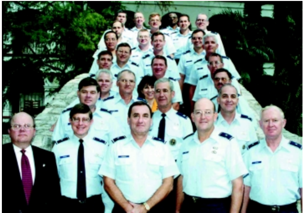
CE leaders assembled in San Antonio, Texas, for the 1999 CE Worldwide Conference in December. Here, they stop for a photograph along the famous River Walk, just outside the hotel where the conference was held.