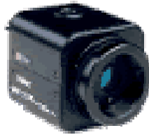
Figure 5 Color CCD Camera

often lost. This resulted in distracting flashes of static and black screens in the video capture image. These limitations will be magnified during real-time crisis situations when the commander needs good quality video signals.