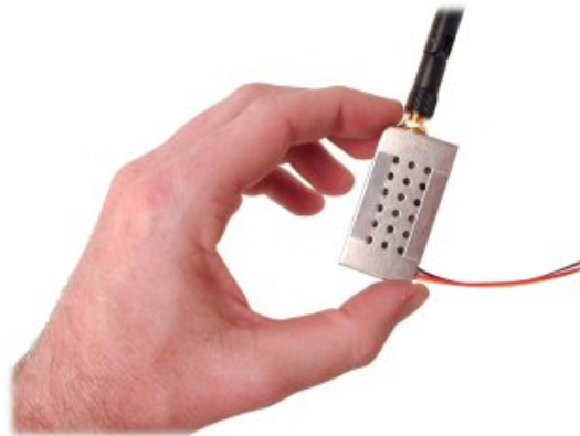
Figure 6-Video Transmission System

To solve the resolution problem with our existing video capture system, we purchased the camera shown in Figure 5. This camera is a color Charged Couple Device (CCD) camera with 450 TV lines of resolution. This provided better resolution for video capture missions.