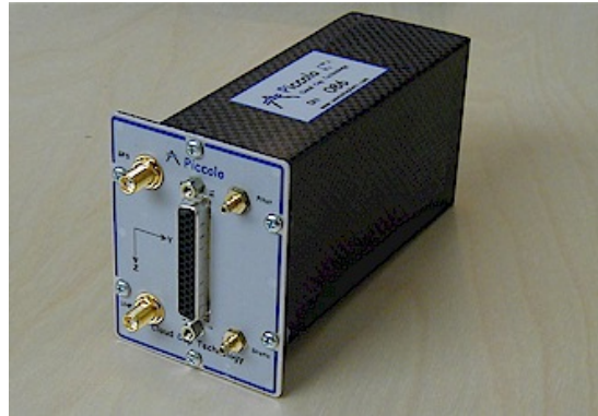
Figure 3 Piccolo Autopilot

The UAVs used for this research are based on the Piccolo autopilot system as shown in Figure 3. This autopilot system includes a Software Developer's Kit (SDK) that can be used to develop specialized UAV applications based on the C++ programming language.