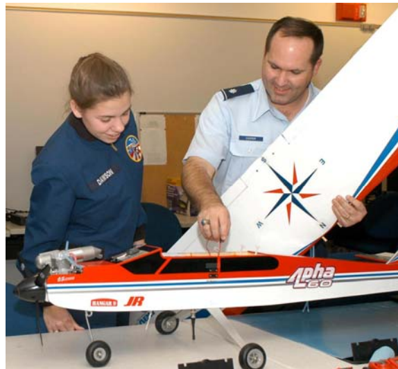
Figure 4 UAV based on Alpha 60™

The Piccolo autopilot is used in such UAVs as the Silver Fox, Pointer, and Aerosonde. Due to operational and financial limitations, we have based our research on a UAV built from the Alpha 60™ remote controlled model airplane [7]. Figure 4 shows a UAV based on the Alpha 60, which has been configured to fly with a Piccolo autopilot. The same Ground Control Station (GCS) that is used for the Silver Fox UAV is used to control the Alpha 60-based UAV. Due to altitude limitations at the Academy, we also add a larger engine to the Alpha 60.