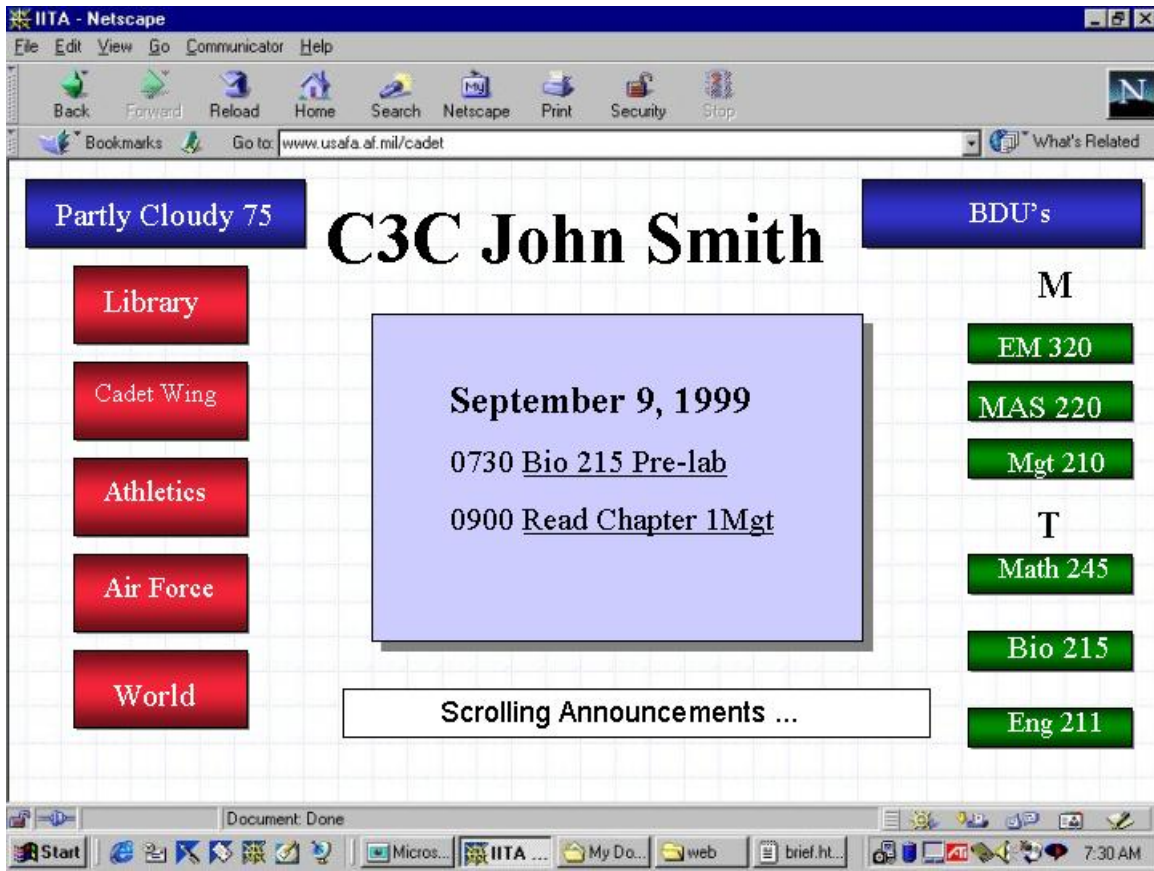
Figure 1: An example of a homepage on a cadet’s desktop developed by the Cadet Personalized Educational Gateway (CPEG) navigational interface.

tools is difficult because different software packages are favored for the development of different applications, and there is no one package that seems sufficient for all skill levels of developers (AFCA TR 99-10).