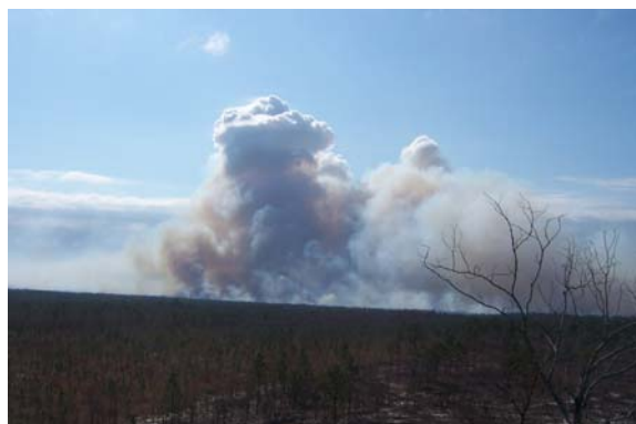
Figure 1. Prescribed Burn on Eglin Air Force Base March 2008.