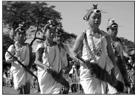
Tribal people from Arunachal Pradesh perform a traditional dance during a festival in Maio, some 700 kms from the state capital Itanagar, in January 2007.

Arunachal Pradesh. Arunachal Pradesh, the largest of the north-eastern states, was earlier known as the Northeast Frontier Agency. It was carved out of Assam in 1972. The State faced no problems of militancy for about 20 years. The NSCN (Khaplang faction) was the first to make an inroad into the virgin territory in the early 1990s following the split in the NSCN. Later, some disgruntled politicians of the state invited the NSCN (IM). The Tirap and Changlang districts have ever since been a hunting ground for both the factions. The IM faction, however, is numerically stronger and better equipped. They carried out Operation Salvation with the ostensible object of spreading consciousness about health and hygiene, but their real objective was to dislodge the Khaplang group and spread Christianity. The NSCN (IM) has managed to entrench itself in the two districts bordering Nagaland.