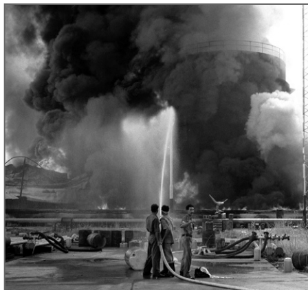
August 1998, firemen try to extinguish a blaze at the Indian Oil Corporation fuel depot in Nagaom, Assam, after an attack by ULFA militants.