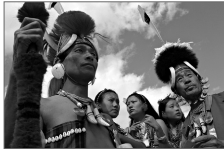
Yimchungru Naga tribe members in traditional dress at the Hornbill Festival in Kisama, Nagaland, in May 2005.

In 1946, a body known as the Naga National Council (NNC) was formed “for the solidarity of Naga tribes.” In a memorandum, the NNC suggested that “the Naga Hills should be constitutionally included in an autonomous Assam, in a free India, with local autonomy and due safeguards for the interests of the Nagas.” Its tone, however, soon underwent a change. In a memorandum submitted on 20 February 1947, the