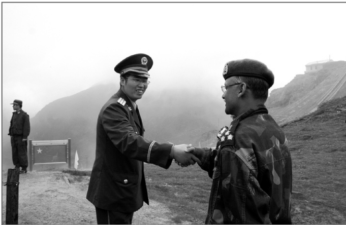
A Chinese army officer (L) exchanges greetings with his Indian counterpart at Nathu La pass on the border between Sikkim and Tibet in July 2006. Formal trading was due to begin at the 4,545-meter pass along the historic Silk Route.

Meanwhile, the Government of India has embarked on a program for an “integrated and holistic development of the region.” It is true that the northeast has intrinsic bottlenecks: the area is geographically remote, the terrain is difficult, infrastructure is poor, capital formation is weak, and the spread of technology is slow. However, the area has its positives: huge deposits of minerals, abundant natural resources, potential for agro-forestry and horticultural sectors including bamboo plantations, vast water resources, proximity to Southeast Asia’s fast growing economies, a highly literate population, rich heritage of handicrafts, and a strong community spirit. The effort is to develop these potentials. A Vision Northeastern Region (NER) 2020 for the northeast has been drawn up. The plan aims to develop all sectors of the region’s economy by exploiting its resource potential. It