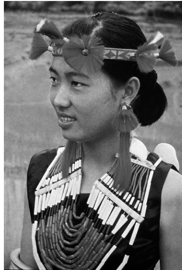
A Sema Naga Girl.

What is actually happening is a turf war for dominance. A church leader, Rev. Zhabu Terhuja, blamed the two NSCN factions for bringing "chaos and destruction" to Nagaland. Attempts to bring about rapprochement have occurred between the two groups. A truce agreement was signed by Kilonser (Cabinet Minister) C Singson of the NSCN (K) and Kilo Kilonser (Home Minister) Azheto Chophy of the NSCN (IM) at Hovishe in Dimapur district on 23 November 2007. However, the higher echelon of the NSCN (IM) did not approve the unity move. Subsequently on 7 December 2007, the three major factions—the NSCN (IM), the NSCN (K), and the NNC—in a rare show of unanimity, agreed to end interfactional bloodshed, pledging immediate cease-fire between themselves for the next 6 months.