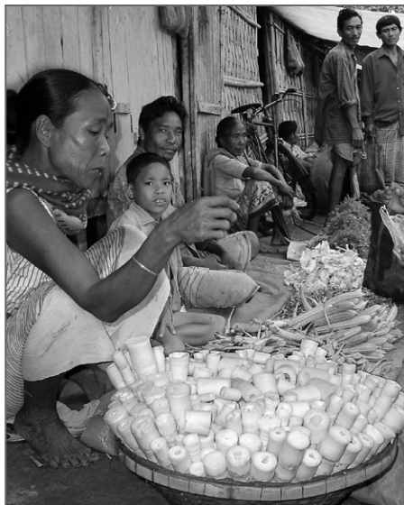
August 2001, a tribal woman sells bamboo shoots, a local delicacy available year-round, in Mandai market 28 kms from Agartala, the capital of Tripura. Tripura's rich forests abound with many varieties of bamboo used by the tribal community for many purposes including food.

The improved security scenario in Tripura is reflected in countries like China, Japan, Germany, and Thailand showing interest in investing or in providing financial assistance to Tripura. The Chief Minister of Tripura, Manik Sarkar, recently claimed that China had agreed to provide technology to set up bamboo-based industries and livelihood opportunities to farmers and tribal people and that the Japan Bank for International Cooperation (JBIC) was going to provide Rs. 3.66 billion as a soft loan to the State. Besides, Germany was giving Rs. 1.12 billion for ecological conservation projects and the development of livelihood resources for tribals and other forest dwellers. A Thai delegation, besides, had expressed interest in investing in tourism, infrastructure, food processing, and agro-based industries. 51