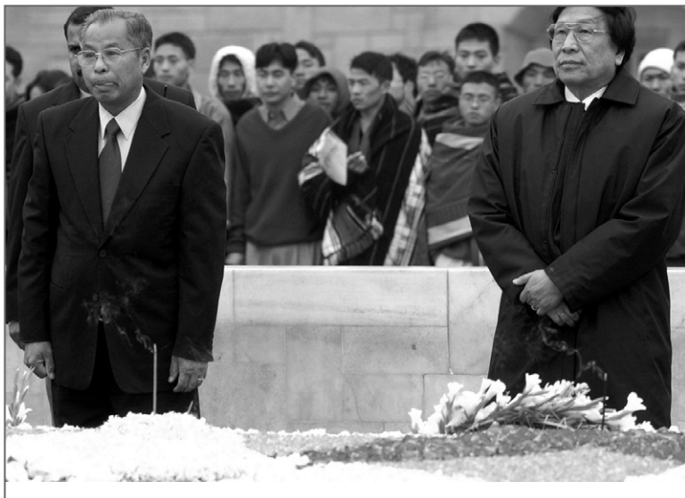
General Secretary of the NSCN Thuingaleng Muivah (R) and NSCN Chairman Isak Chisi Swu (L) pay tribute to Mahatma Gandhi at his mausoleum in New Delhi, 9 January 2003. The two exiled separatist leaders were due to hold peace talks in the Indian capital.

Ironically, resentment is building among the Naga tribes of Nagaland over the Tangkhul dominance of the NSCN (IM). Being a Tangkhul, Muivah