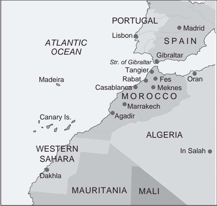
Morocco and Surrounding Area