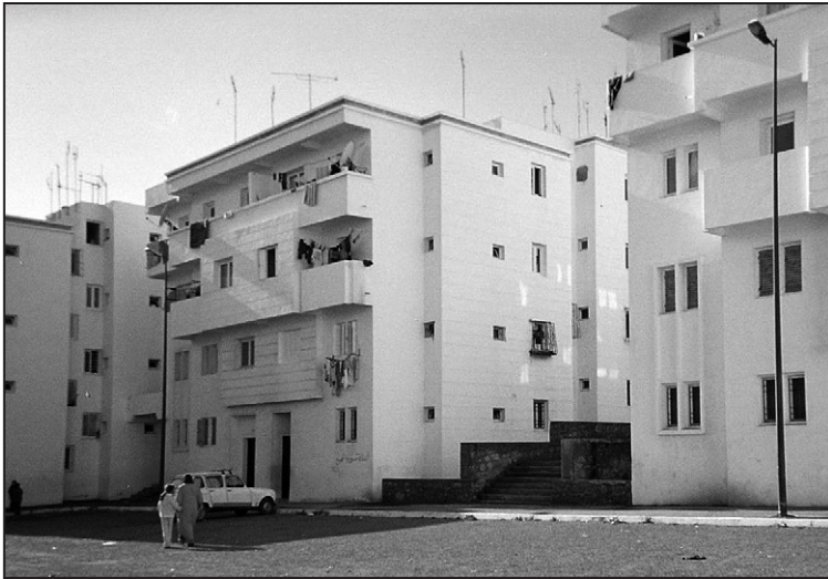
Figure 2. Homes in Said Hajji, development where about half of Sehb el Caïd households will relocate

factors. For example, building only one water meter per street in a bidonville not only simplifies the project but requires residents to elect one of their own to monitor usage, determine each family's bill, and collect the money, creating a culture of participation and accountability. 32 Another component of the new campaigns is accompagnement social , whereby outside facilitators help the bidonville populace to determine their goals, priorities, and unacceptable outcomes from the housing program. Besides ensuring money is well spent, this approach builds citizens' understanding of participation, skills at conflict-resolution, and a sense of ownership.