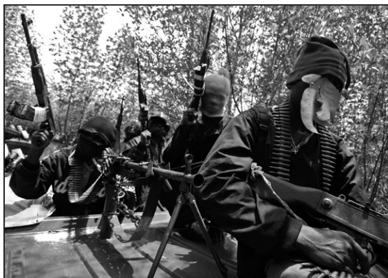
Figure 9. Niger Delta vigilante militants near their camp in Okrika, Rivers State, Nigeria. Rival gangs, police, and private security clashes have cost many lives in fighting that in part is for control or a share of oil wells there.

charges of complicity in excessive force and impropriety while protecting pipelines, equipment, and operations from militants. At the other end of the spectrum, criminality among poor communities has generated “private security in the form of vigilante groups and village or community volunteer police or guards who impose order as they judge appropriate.” 59