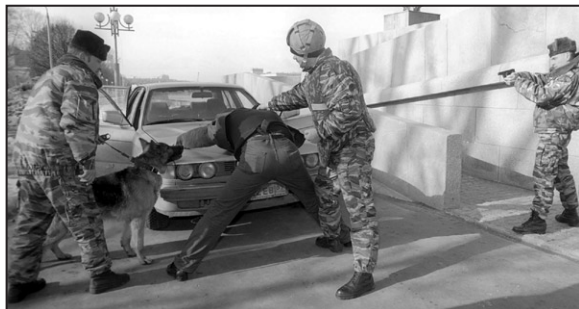
Figure 1. MVD forces in Moscow arresting an armed criminal, focused on crimes connected with illegal purchasing, selling, possession-keeping, and smuggling arms and explosives.

By the fall of 2003, Russian specialists estimated that there were 16,000 registered firms employing about 350,000 people (up from 11,000 firms and 165,000 employees in 1999). 18 By early 2005, the number of firms estimated had risen to 21,000 employing perhaps 500,000 security officers and other personnel. 19 A number of these firms and individuals were deeply involved in organized criminal activity or had turned into small private armies for individuals or organizations whose goals by and large did not correspond with public interest. The sheer number of these companies is not always what it appears. In an innovation newly highlighted in May 2007, multiple private security firms are being formed by individual owners. In some cases, only one of several firms registered by an individual owner will be active, with the remaining ones only maintained as shells. There are estimated to be more than 2,500 registered, but inactive, firms. MVD analysts believe that one reason underlying this practice is the avoidance of damaging legal penalties. That is, if a firm or its employees are implicated in crime or other malfeasance threatening prosecution or dissolution, firm owners simply transfer personnel and security contracts to an inactive ChOP and continue business. In addition, MVD officials think that some shell firms are used by organized crime figures who hire themselves for the purpose of legally acquiring firearms. 20