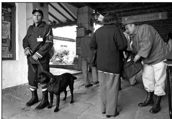
Figure 6. Colombian private security guard with sniffer dog searches patrons at a Colombian shopping mall in Bogotá.

Colombia's decades of conflict and terrorism have made it one of the best known centers of autodefensas and other well-armed private militias, the most famous/notorious being the United Self-Defense Forces of Colombia ( Autodefensas Unidas de Colombia --AUC). Linked crime and conflict—and the presence of huge arms supplies and trained fighters—have generated professed private security organizations of all types, a number so well known for human rights abuses and criminal involvement that it need not be addressed in any detail here. 45 Oversight of the countless formal and informal security entities is scarcely conceivable amidst the other problems. Nevertheless, the need—and government ineffectiveness—continue to generate attention as security firms' involvement in “money laundering, drug trafficking, and paramilitarism” continue to function and grow.