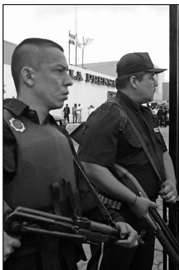
Figure 4. A Nicaraguan police officer (left) and private security guard provide security outside Managua’s La Prensa newspaper office during a hostage situation. Nicaraguans serve in large numbers in Costa Rican private security firms as well.

Public impatience with violent criminals has generated formal local and neighborhood organizations and informal vigilante groups that have taken