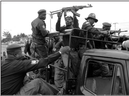
Figure 8. Nigerian private security personnel sometimes operate with small, heavily armed, government Mobile Police and are also employed to protect businesses and individuals from the Mounted Police who are feared for “kill and go” depredations.

Nigerian private security personnel for the most part have been prohibited from carrying weapons. The assignment of small, heavily armed “Mobile Police” elements to private companies, however, has provided private security with an armed presence.