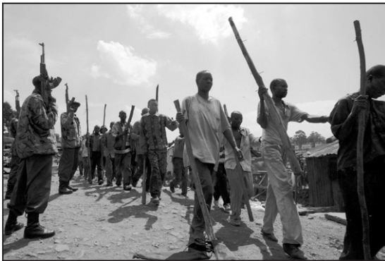
Figure 10. Violent Mungiki gang members are rounded up by police in a Nairobi slum. Fears of the Mau Mau like Mungiki movement has spurred the creation of hundreds of private security organizations.

Kenya's capital city Nairobi is often characterized as one of the most dangerous places on earth. Random and violent crime has resulted in "fear and insecurity" becoming "defining features of life" as one commentator put it. This environment has generated a growing private security establishment as similar circumstances have in so many places. 62 Kenya's continuing poor economic performance and deep poverty have gone hand in hand with dysfunctional institutions and corruption. Longstanding concerns with criminal violence and the burgeoning crime against persons and property, engendered by these kinds of conditions, have been expanded further in Nairobi by the appearance of the violent Mungiki outlaw or bandit sect. While the sect began in the late 1980s, it became increasingly visible as years went by and is now credited with many thousands of members by some counts.