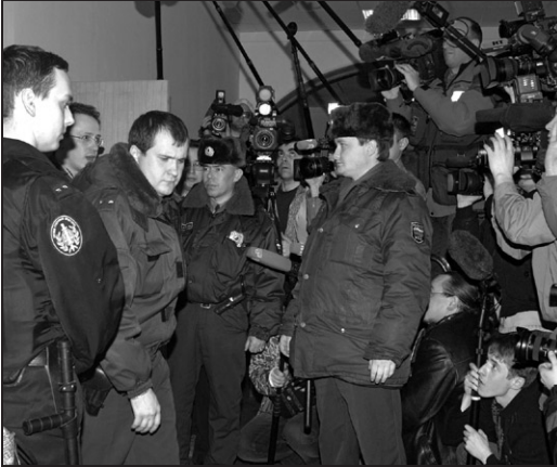
Figure 2. Police escort the chief executive of VIP Bank from a Moscow court room. He was suspected of ordering the murder of the Central Bank deputy governor. Potential violent resistance by the armed security organizations of banks and other businesses sometimes requires heavily armed and well-trained special units in support of regular officers.

is a strong probability that the efforts of investigators and operatives will be opposed by security guards and private security services. 27