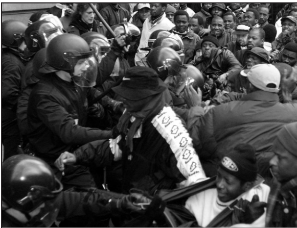
Figure 15. Immigrants clashing with French antiriot police near Paris—authorities worry about the more subtle dangers of terrorist-oriented security firms ostensibly formed to protect businesses from crime and unrest.

On the other side of the world the erupting violence in France by youths and others, drawn largely from the marginalized Islamic population of France's bigger cities, preoccupied French police, security, and intelligence organizations increasingly over the last year. The violence—beginning in the fall of 2005 and relieved subsequently by simmering unrest and tension among business and the populace—increased the importance of private security resources to supplement French local and national law enforcement. Many months before the worst of the riots broke out, however, French authorities in early 2005 discovered that a corrupt security firm with personnel recruited by a notorious jihadist was guarding many of the commercial businesses and entertainment facilities in the Paris area. The grave vulnerability such firms could pose resulted in security and guard service companies becoming the subject of particular attention and surveillance, with several suspected of being infiltrated by Islamic extremists. 104