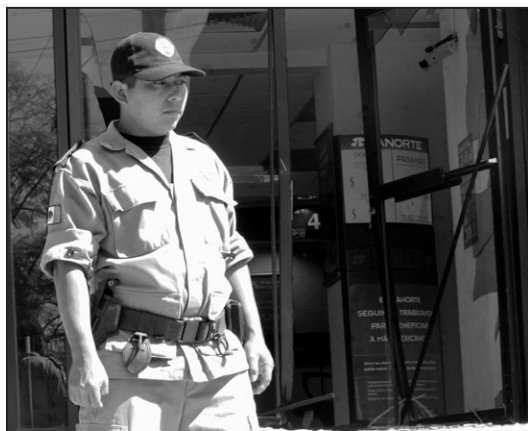
Figure 3. Mexican private security officer—one of many thousands—in front of the Oaxaca City Banorte bank following the detonation of an explosive device in 2006.

High crime rates and unreliable police spurred the creation of Mexican private security businesses of various types and the migration of foreign security branches from the larger firms in the U.S. and elsewhere. Between 1998 and 1999 alone, private security companies reportedly increased by about 40 percent, resulting at the turn of the millennium to more than an estimated 10,000 ill-monitored private security firms, only 2,984 of which were registered with 153,885