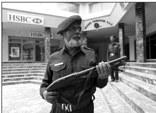
Figure 13. An explosion in the number of private security personnel such as these at a bank in Karachi, Pakistan has been generated by high crime and the fear of terrorism. These are the kinds of firms, as jihadist literature suggests, that may be vulnerable to compromise.

Private security criminality aimed at financial institutions has been a particular concern with terrorist dimensions. It sparked an official campaign to better vet private security officers serving in banks, money-changing operations, and even automatic teller machines (ATMs). While customers worried about security personnel watching as they conducted ATM business, the greatest law enforcement concern was about armed bank robberies. The aptly named “Maverick Security Agency,” headed by a retired Pakistani Army colonel, was shut down following an armed robbery in which the colonel fled when the office was raided. Such robberies had led police to acknowledge that intelligence reporting and other indications of militants infiltrating private security forces suggest extremists were behind some thefts. They believe that large amounts of foreign currency stolen “may be used to fund subversive activities.” 96 What is thought by Pakistani officials to be a deliberate effort to infiltrate or form private security agencies has led to the imposition of other administrative and oversight countermeasures. However, the substantial number of unlicensed firms—equipped with unauthorized weapons—constitutes a continuing danger to institutions and private Pakistani citizens. 97