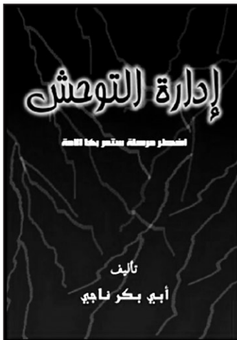
Figure 12. Cover of Management of Savagery , which has been translated and posted under the auspices of the Combating Terrorism Center, U.S. Military Academy at West Point.

These targets vary in their vulnerability and potential impact, and it may be that private security establishments offer some the greatest payoffs combined with effective cover and reduced risks.