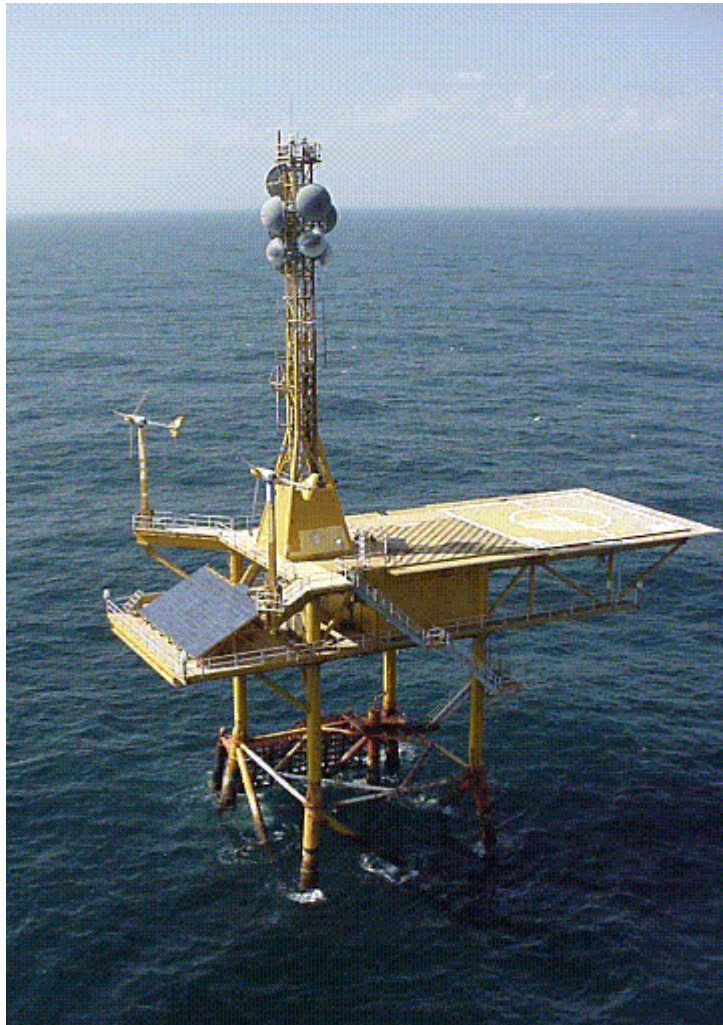
[Figure 1. The M2R6 platform. This “master” platform is located in 33 m water depth about 60 km offshore. Power on the three master platforms is generated by photovoltaic panels, wind generators and a diesel backup generator. A high-bandwidth microwave network is used for communications between master platforms and shore. Helicopter transportation of personnel is used for most servicing operations.]

where possible, to make instrument packages serviceable from the platform (minimizing the need for weather-dependent ship and diving operations).