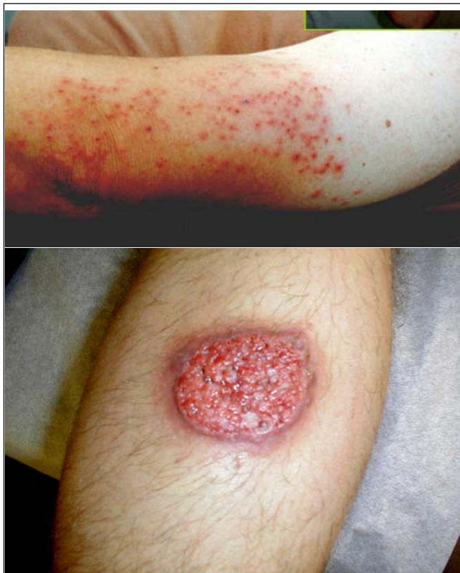
Figure 4. Examples of dermal leishmaniasis contracted in Iraq during Operation Iraqi Freedom. Note in the top photo that the area of the arm covered by the shirt sleeve is free of bites, demonstrating the value of simple measures in the prevention of insect bites.

State University for field testing against sand flies in Turkey.