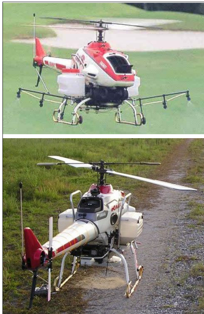
Figure 1. Yamaha RMax unmanned aerial vehicle fitted with ULV spray nozzles (top) and with twin hopper (bottom) for application of granular larvicide to control mosquitoes.

has been facilitated by DWFP funds and objectives to meet one of the strategic DoD goals of fielding unmanned vehicles.