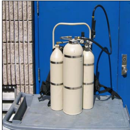
Figure 2. The first backpack ULV sprayer system developed under DWFP grants operates almost silently with compressed air from cylinders.

Two DWFP projects have employed pyriproxyfen, the most powerful insect growth regulator (IGR), against dengue vector mosquitoes. In the Peruvian Amazon community at Iquitos, Stancil 42 (Naval Medical Research Center Detachment, Peru) received a grant to optimize strategies for preventing the breeding of Aedes aegypti mosquitoes in containers of water. The project ran for 3 years, and involved collaboration with Peruvian scientists and researchers from the University of California and Rothamsted Research, United Kingdom. In addition to simply stopping the breeding of mosquitoes in treated habitats, effective quantities of pyriproxyfen IGR are transferred from one container to another by mosquito females as they go from site to site laying their eggs, thus impacting more habitats than were treated directly. Mosquito population suppression across whole suburbs of the city has effectively prevented dengue transmission without the need to spray adulticides. Building on that achievement, researchers at the Armed Forces Research Institute of Medical Sciences, Bangkok, 43 in