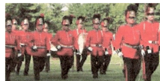
Connecticut Militia Governor's Guard

Several SDFs have privately owned fixed-wing aircraft detachments in their force structure. Virginia uses its aircraft extensively as drones for WMD scenarios and assists the Virginia Fish and Game Commission by flying reconnaissance missions over the Shenandoah Valley. While predominantly a ceremonial organization, the Connecticut SDF has occasionally used its cavalry detachment for cross country search and rescue missions.