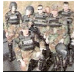
Members of the Washington State Guard attend civil protection