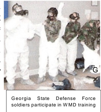
Georgia State Defense Force soldiers participate in WMD training

The expanded use of volunteer military organizations provides an opportunity for increasing numbers of citizens to serve in a less demanding military environment than the Federal Active or Reserve military. Of those who enter the Active military, 14 percent leave during the first 6 months and over 30 percent before their first term is complete. Reasons for this attrition include inadequate medical and pre-entry drug screening. Moreover, recruits fail to perform adequately because they are in poor physical condition for basic training or lack motivation. 10 Routinely, State Guard units during World War II took advantage of National Guard discharges from Active service due to stringent physical standards associated with overseas deployments. Approximately 3,400 National Guardsmen were discharged prior to deployment, providing trained resources capable of State Guard service. 11