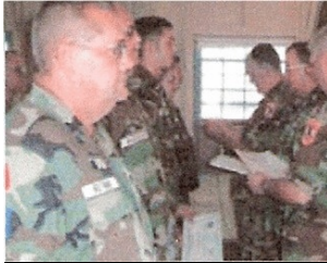
Members of the Virginia Defense Force communications unit complete field training at Fort Pickett, Virginia

In the case of SDFs, their organization and use have too often been an afterthought. From the Mexican border expedition through the Korean War, and from the bombing of Pearl Harbor to the 9/11 attacks, State and Home Guard use has been a last-minute reaction to unexpected circumstances. With today's increase in asymmetric warfare, exploring the use of all existing force structures and expanding volunteer military organizations and SDFs are steps in the right direction.