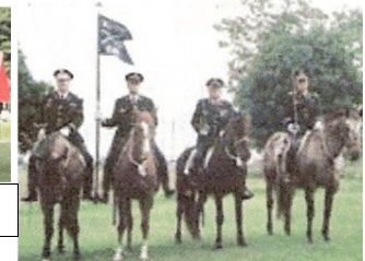
Cavalry Troop A of the Maryland Defense Force Performs mounted drills at Antietam National Battlefield

The Georgia SDF shares robust chemical, biological, radiological, and nuclear and explosives capabilities with the Centers for Disease Control and several hospitals in the Atlanta area. The force has acquired the skills of chemists, medical doctors, and other professionals to fashion an organization to advise, assist, and train with the specialized Georgia National Guard Weapons of Mass Destruction Civil Support Team. 9