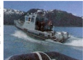
Washington State's 492 d Coastal Command conduct patrol training

For example, when National Guard units are mobilized, SDFs often assume control of their armories and assist with their mobilization. 8 The Alaskan SDF also routinely provides security for the Alaskan pipeline and the harbors of Anchorage and Whittier, using four armed patrol craft. With an instructor cadre of current or former state troopers, graduates of the Alaskan SDF Military Police Academy have the same credentials as Alaskan state troopers. In the aftermath of the 9/11 attacks, Albany utilized the New York Guard Army Division's Military Police Brigade as perimeter and infrastructure security at Camp Smith and within New York City. Similarly, Air Force SDFs in Texas and New York routinely augment base security forces along with assisting in administrative duties. In addition to the Coast Guard Auxiliary, Naval Militias add another dimension to state-sponsored volunteer military organizations, providing waterborne patrol assets for security missions.