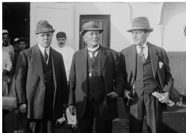
Gen. Victoriano Huerta (center) on his arrival in New York City.