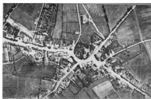
Passchendaele, 16th of June 1917

Terrence Finnegan's Shooting the Front is a massive, expertly written and richly illustrated history of British, French and American aerial surveillance on the Western Front. The book's findings are based on meticulous archival research, especially in the National Archives in College Park, Maryland, for the American side, and London's National Archives for the British. Finnegan's prose is precise and clear, and he provides the necessary historical context to make his work accessible to expert and layman alike. The photographs of the battlefield, surveillance aircraft, and deception devices—as well as maps, line