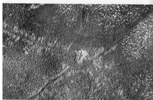
Passchendaele, 5th of December 1917