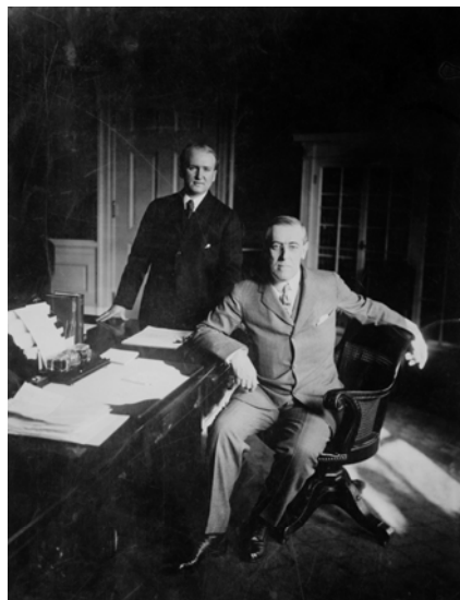
President Wilson (seated) with his private secretary, Joseph Tumulty, a key gatekeeper in passing information to the president.

regions and promoted US businesses in their area.