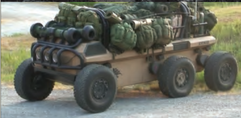
The MULE EEU, configured as a MULE-T, is undergoing capability testing at Camp Gruber, OK. The MULE-T can carry two squads' worth of weapons, ammo and equipment.

MULE-T is designed to be the Soldiers' "pickup truck." With a payload of more than 1,900 pounds, the MULE-T will take loads off Soldiers' backs. Designed to carry more than two squads' worth of equipment, it provides commanders a flexible platform to move supplies and equipment throughout the operational environment, freeing Soldiers to focus on combat tasks. This ability to form robotic convoys will further take Soldiers out of harm's way by letting these robust robots carry loads instead of placing drivers on the road. The capability of a medium robot to autonomously navigate on the modern battlefield frees Soldiers from having to "teleoperate" it as we do robots today. By integrating ANS onto the MULE, the robot is now able to