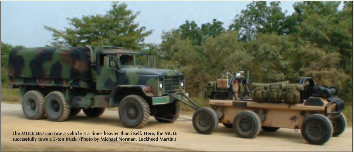
The MULE EEU can tow a vehicle 3.5 times heavier than itself. Here, the MULE successfully tows a 5-ton truck.

The MULE is the multifunctional vehicle developed by Lockheed Martin Missiles and Fire Control (LM MFC) as part of the Army's Future Combat Systems (FCS) program. The MULE is a family of unmanned ground vehicles (UGVs) that will be in the 7,000 pound class of medium robots. Within 20 years, the MULE will be commonplace in every brigade in the Army. What makes these systems unique is the mobility, processing power, networked connectivity and robot size. The MULE family consists of three robotic vehicles: the MULE Transport (MULE-T), the MULE Countermine (MULE-C) and the Armed Robotic Vehicle-Assault (Light) (ARV-A(L)).