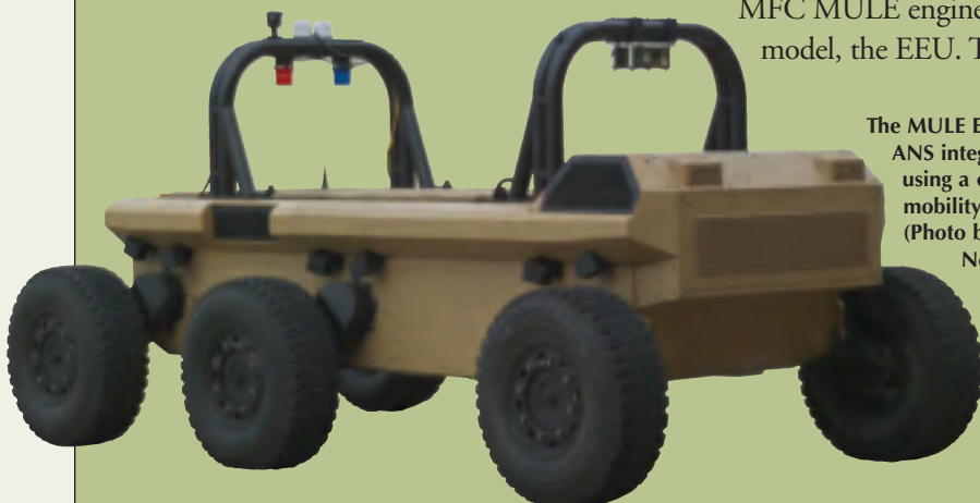
The MULE EEU conducts ANS integration testing using a common mobility platform.

This means that early in the product development cycle we understand what data is available and how it is tied to vehicle performance. This allows the Army to better project when parts will fail, further reducing Soldier sustainment burdens due to a greatly reduced logistics train. It also will result in a lower life-cycle cost for spares for the MULE in the future.